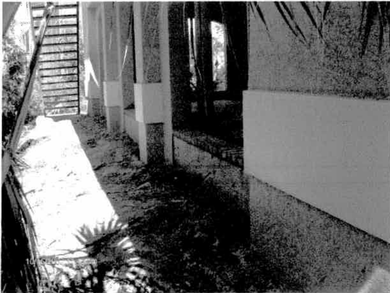
Rear View 10/15/07