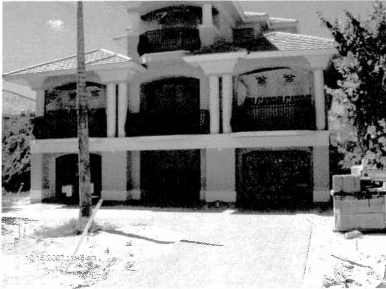
Front View 10/15/07

If using the Elevation Certificate to obtain NFIP flood insurance, affix at least two building photographs below according to the instructions for Item A6. Identify all photographs with: date taken; "Front View" and "Rear View"; and, if required, "Right Side View" and "Left Side View." If submitting more photographs than will fit on this page, use the Continuation Page, following.