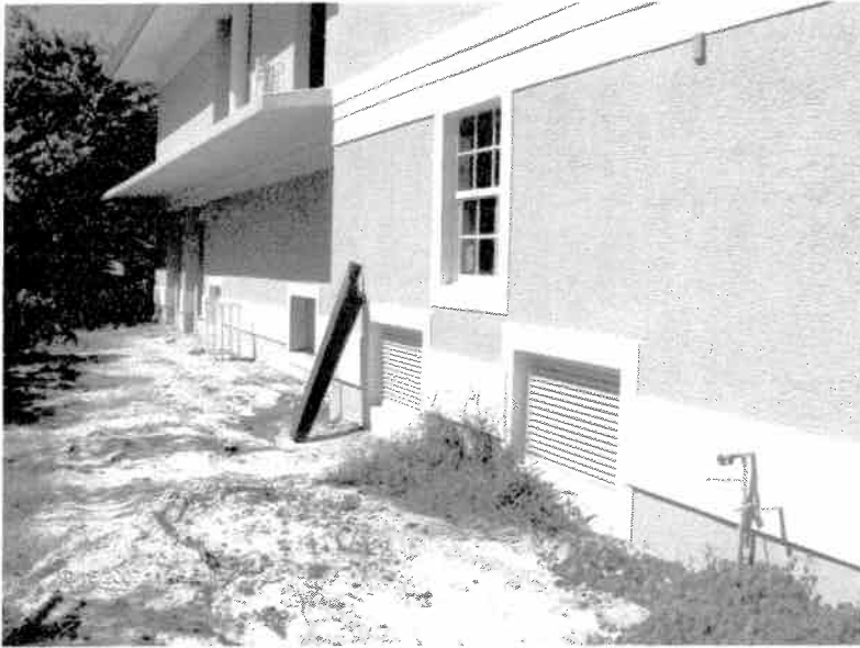
Left Side View 10/15/07

If using the Elevation Certificate to obtain NFIP flood insurance, affix at least two building photographs below according to the instructions for Item A6. Identify all photographs with: date taken; "Front View" and "Rear View"; and, if required, "Right Side View" and "Left Side View." If submitting more photographs than will fit on this page, use the Continuation Page, following.