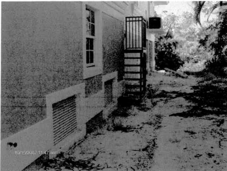
Right Side View 10/15/07