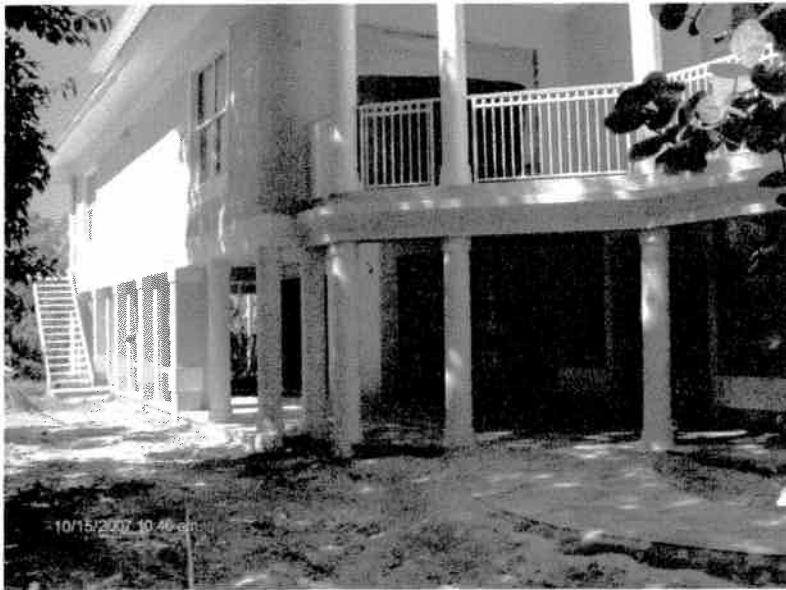
Left Side View 10/15/07

If using the Elevation Certificate to obtain NFIP flood insurance, affix at least two building photographs below according to the instructions for Item A6. Identify all photographs with: date taken; "Front View" and "Rear View"; and, if required, "Right Side View" and "Left Side View." If submitting more photographs than will fit on this page, use the Continuation Page, following.