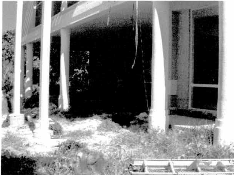
Rear View 10/15/07