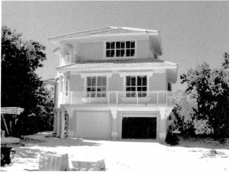
Front View 10/15/07

If using the Elevation Certificate to obtain NFIP flood insurance, affix at least two building photographs below according to the instructions for Item A6. Identify all photographs with: date taken; "Front View" and "Rear View"; and, if required, "Right Side View" and "Left Side View." If submitting more photographs than will fit on this page, use the Continuation Page, following.