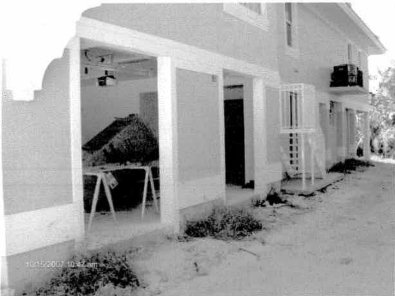
Right Side View 10/15/07