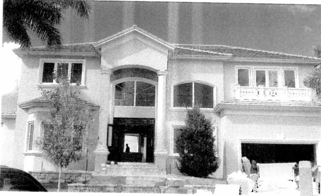
Front View: 11/21/2011