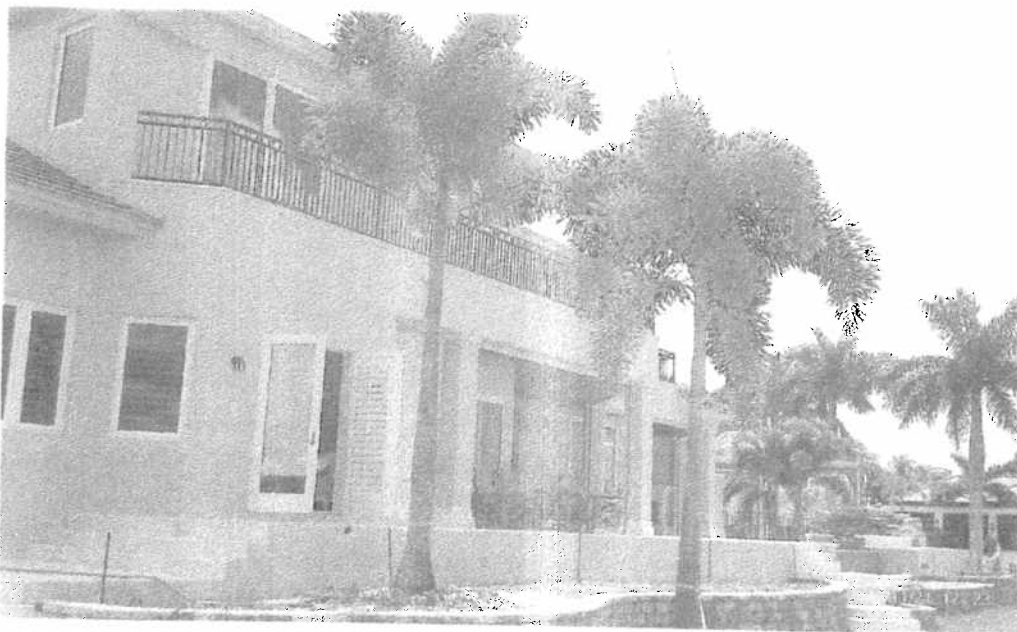
Rear View: 11/21/2011