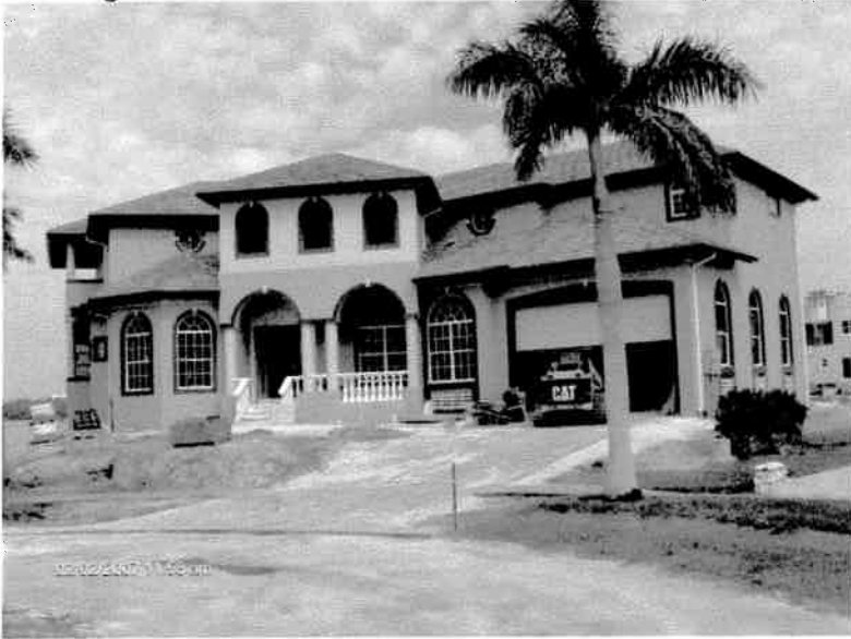
Front View 2/05/07

If using the Elevation Certificate to obtain NFIP flood insurance, affix at least two building photographs below according to the instructions for Item A6. Identify all photographs with: date taken; "Front View" and "Rear View"; and, if required, "Right Side View" and "Left Side View." If submitting more photographs than will fit on this page, use the Continuation Page, following.