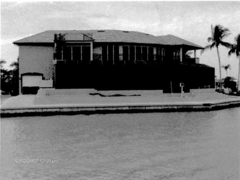
Rear View 2/05/07