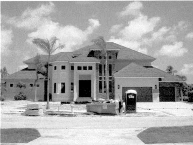
Front view taken 07/14/2011

If using the Elevation Certificate to obtain NFIP flood insurance, affix at least two building photographs below according to the instructions for Item A6. Identify all photographs with: date taken; "Front View" and "Rear View"; and, if required, "Right Side View" and "Left Side View." If submitting more photographs than will fit on this page, use the Continuation Page, following.