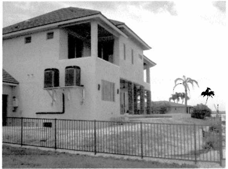
Rear view taken 07/14/2011