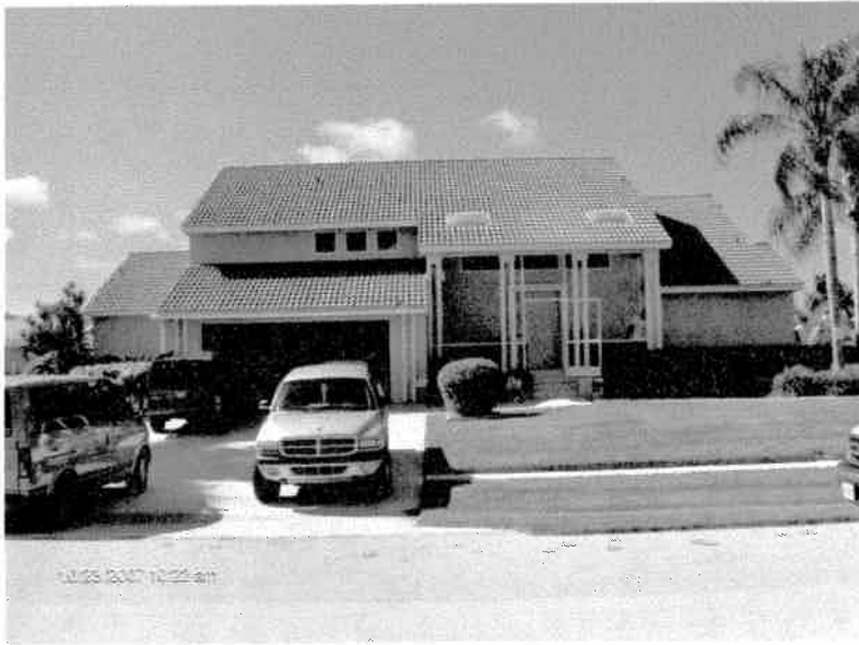
Front View 10/23/07

If using the Elevation Certificate to obtain NFIP flood insurance, affix at least two building photographs below according to the instructions for Item A6. Identify all photographs with: date taken; "Front View" and "Rear View"; and, if required, "Right Side View" and "Left Side View." If submitting more photographs than will fit on this page, use the Continuation Page, following.