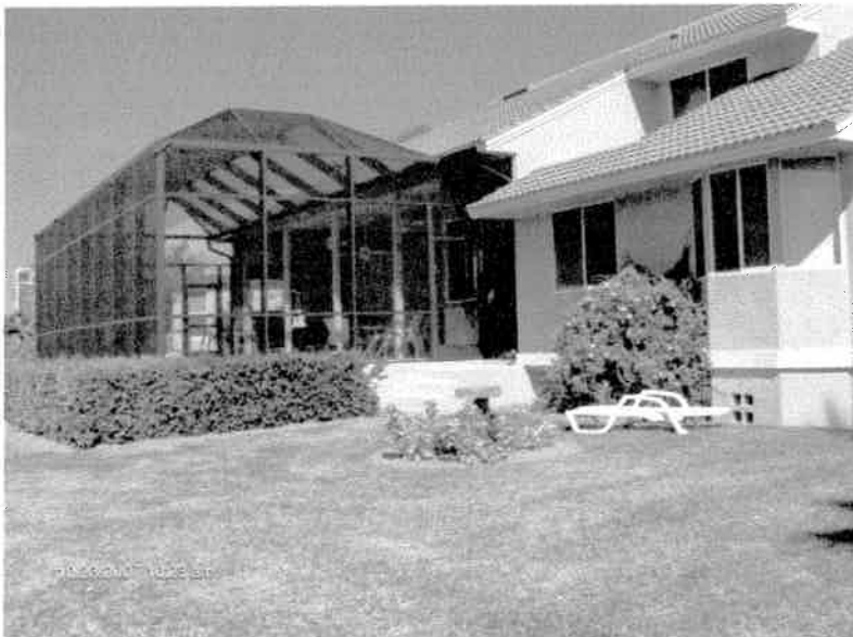
Rear View 10/23/07