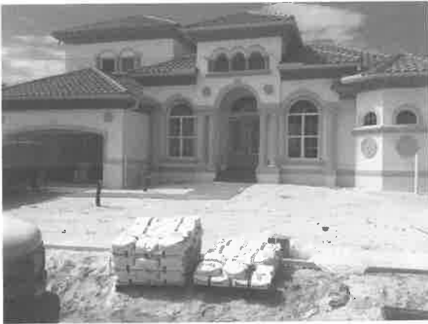
Front View 2/19/2013

If using the Elevation Certificate to obtain NFIP flood insurance, affix at least two building photographs below according to the instructions for Item A6. Identify all photographs with: date taken; "Front View" and "Rear View"; and, if required, "Right Side View" and "Left Side View." If submitting more photographs than will fit on this page, use the Continuation Page, following.