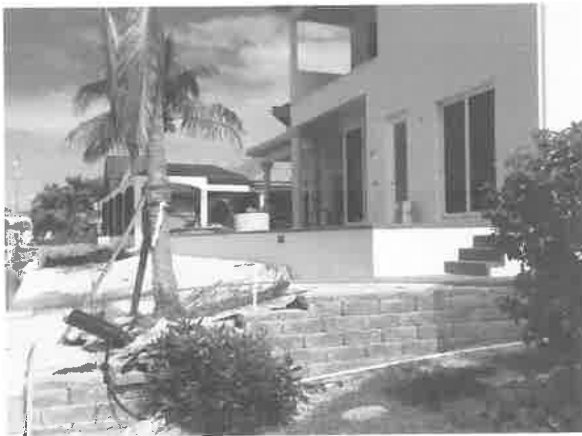
Rear View 2/19/2013