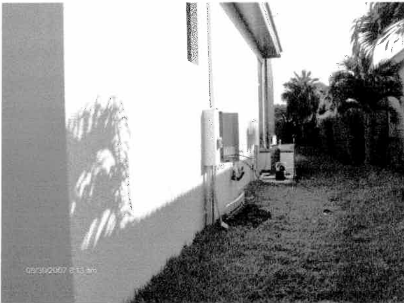
Right Side View 8/30/07