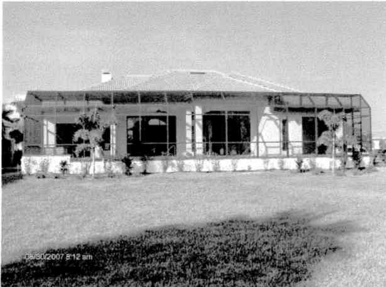
Rear View 8/30/07