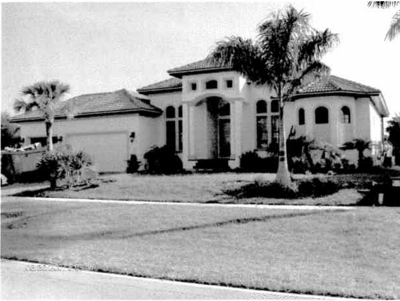
Front View 8/30/07

If using the Elevation Certificate to obtain NFIP flood insurance, affix at least two building photographs below according to the instructions for Item A6. Identify all photographs with: date taken; "Front View" and "Rear View"; and, if required, "Right Side View" and "Left Side View." If submitting more photographs than will fit on this page, use the Continuation Page, following.