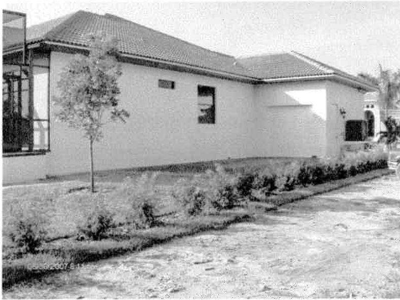
Left Side View 8/30/07

If using the Elevation Certificate to obtain NFIP flood insurance, affix at least two building photographs below according to the instructions for Item A6. Identify all photographs with: date taken; "Front View" and "Rear View"; and, if required, "Right Side View" and "Left Side View." If submitting more photographs than will fit on this page, use the Continuation Page, following.