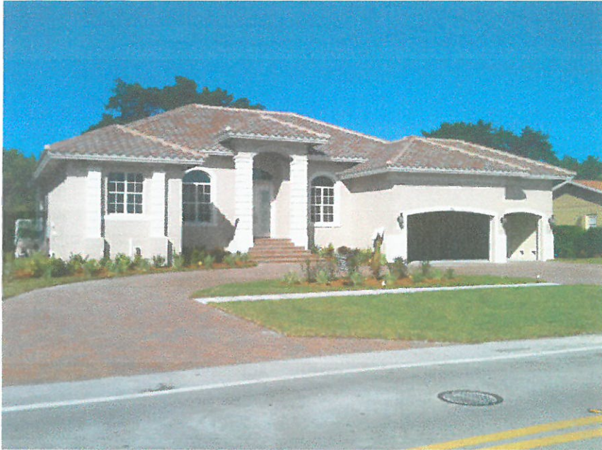
FRONT VIEW 10/30/2013

If using the Elevation Certificate to obtain NFIP flood insurance, affix at least 2 building photographs below according to the instructions for Item A6. Identify all photographs with date taken; "Front View" and "Rear View"; and, if required, "Right Side View" and "Left Side View." When applicable, photographs must show the foundation with representative examples of the flood openings or vents, as indicated in Section A8. If submitting more photographs than will fit on this page, use the Continuation Page.