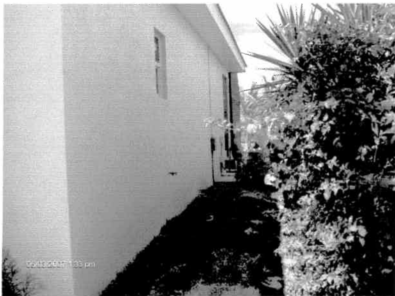
Right Side View 5/3/07