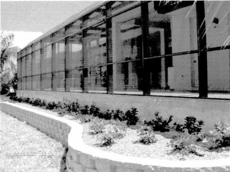
Rear View 5/3/07