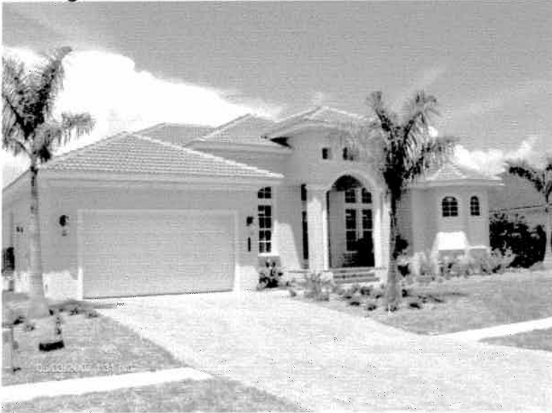
Front View 5/3/07

If using the Elevation Certificate to obtain NFIP flood insurance, affix at least two building photographs below according to the instructions for Item A6. Identify all photographs with: date taken; "Front View" and "Rear View"; and, if required, "Right Side View" and "Left Side View." If submitting more photographs than will fit on this page, use the Continuation Page, following.