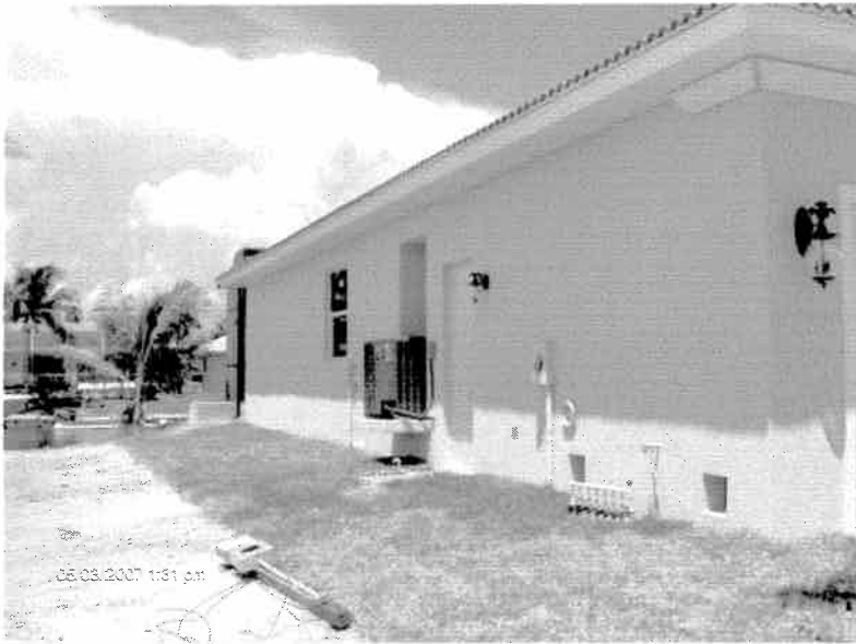
Left Side View 5/3/07

If using the Elevation Certificate to obtain NFIP flood insurance, affix at least two building photographs below according to the instructions for Item A6. Identify all photographs with: date taken; "Front View" and "Rear View"; and, if required, "Right Side View" and "Left Side View." If submitting more photographs than will fit on this page, use the Continuation Page, following.