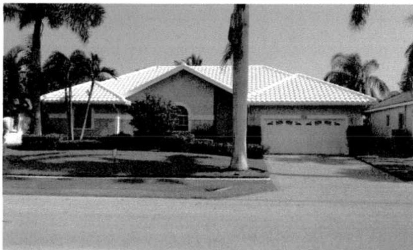
Front View (6/16/2011)

If using the Elevation Certificate to obtain NFIP flood insurance, affix at least two building photographs below according to the instructions for Item A6. Identify all photographs with: date taken; "Front View" and "Rear View"; and, if required, "Right Side View" and "Left Side View." If submitting more photographs than will fit on this page, use the Continuation Page, following.