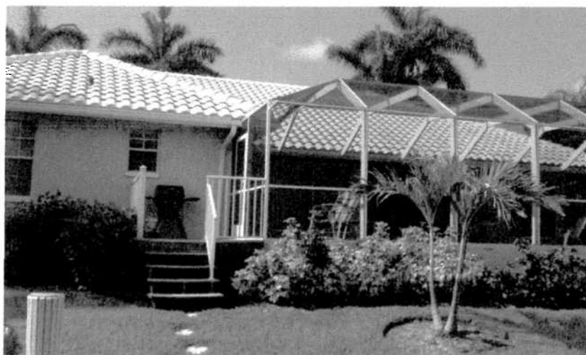
Rear View (6/16/2011)