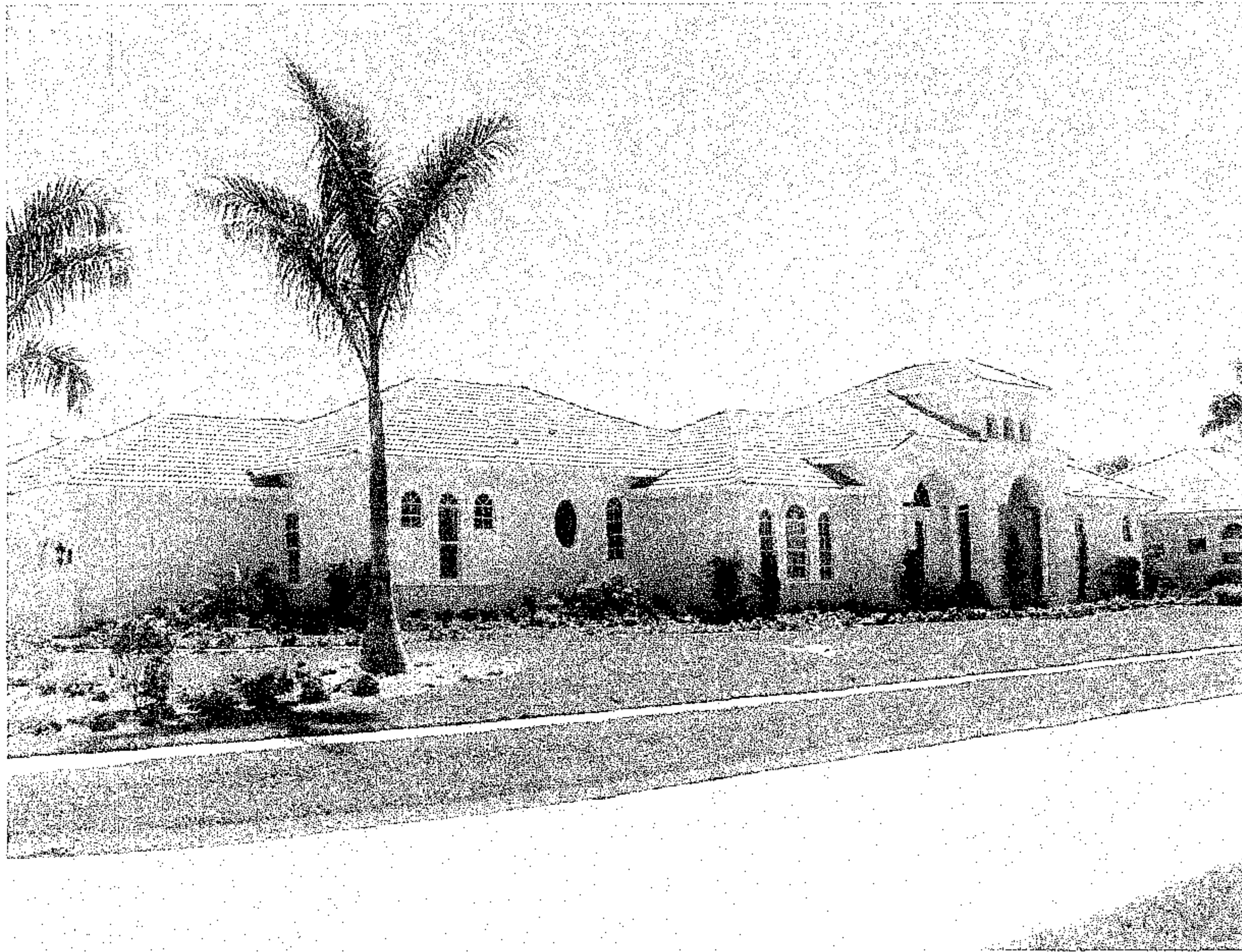
Front View 04/11/08

If using the Elevation Certificate to obtain NFIP flood insurance, affix at least two building photographs below according to the instructions for Item A6. Identify all photographs with: date taken; "Front View" and "Rear View"; and, if required, "Right Side View" and "Left Side View." If submitting more photographs than will fit on this page, use the Continuation Page, following.