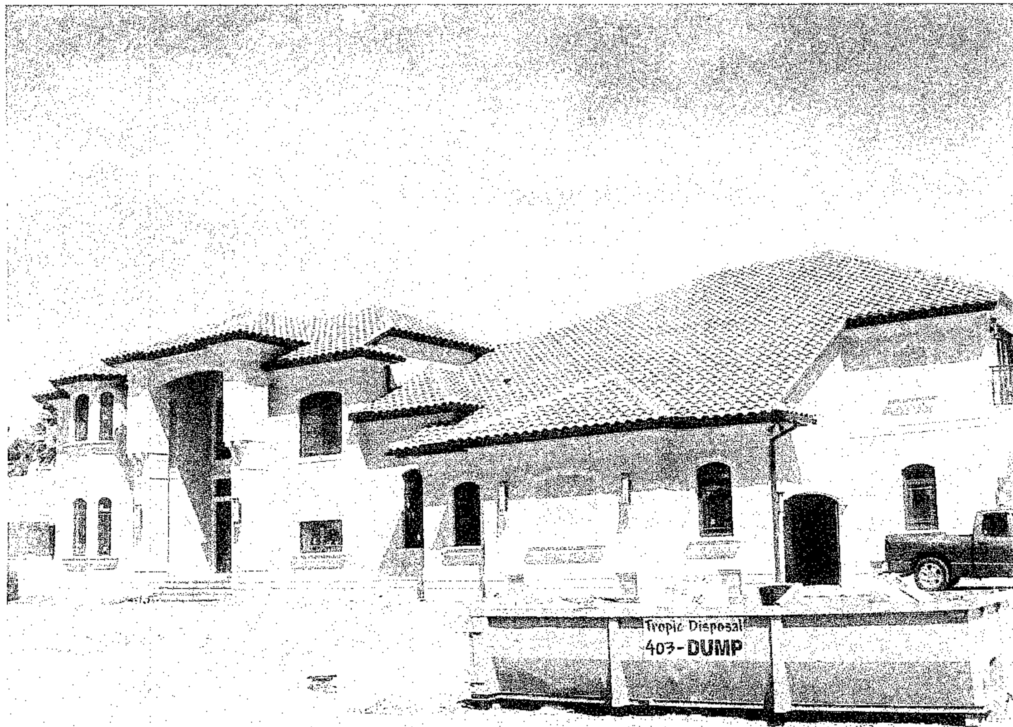
Front View 03/03/08

If using the Elevation Certificate to obtain NFIP flood insurance, affix at least two building photographs below according to the instructions for Item A6. Identify all photographs with: date taken; "Front View" and "Rear View"; and, if required, "Right Side View" and "Left Side View." If submitting more photographs than will fit on this page, use the Continuation Page, following.