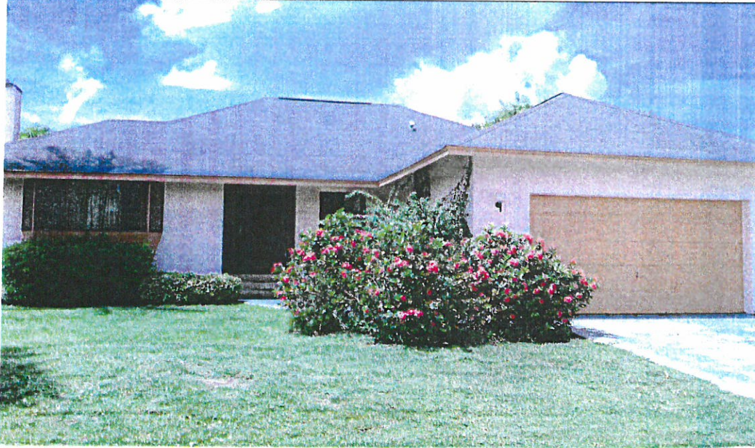
Front View: 09/14/2012

If using the Elevation Certificate to obtain NFIP flood insurance, affix at least two building photographs below according to the instructions for Item A6. Identify all photographs with: date taken; "Front View" and "Rear View"; and, if required, "Right Side View" and "Left Side View." If submitting more photographs than will fit on this page, use the Continuation Page, following.