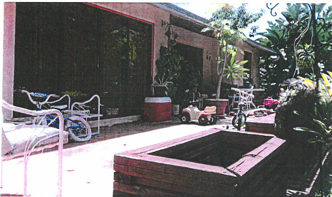
Rear View: 09/14/2012