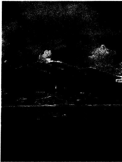
FRONT VIEW: 8/27/2008

If using the Elevation Certificate to obtain NFIP flood insurance, affix at least two building photographs below according to the instructions for Item A6. Identify all photographs with: date taken; "Front View" and "Rear View"; and, if required, "Right Side View" and "Left Side View." If submitting more photographs than will fit on this page, use the Continuation Page, following.