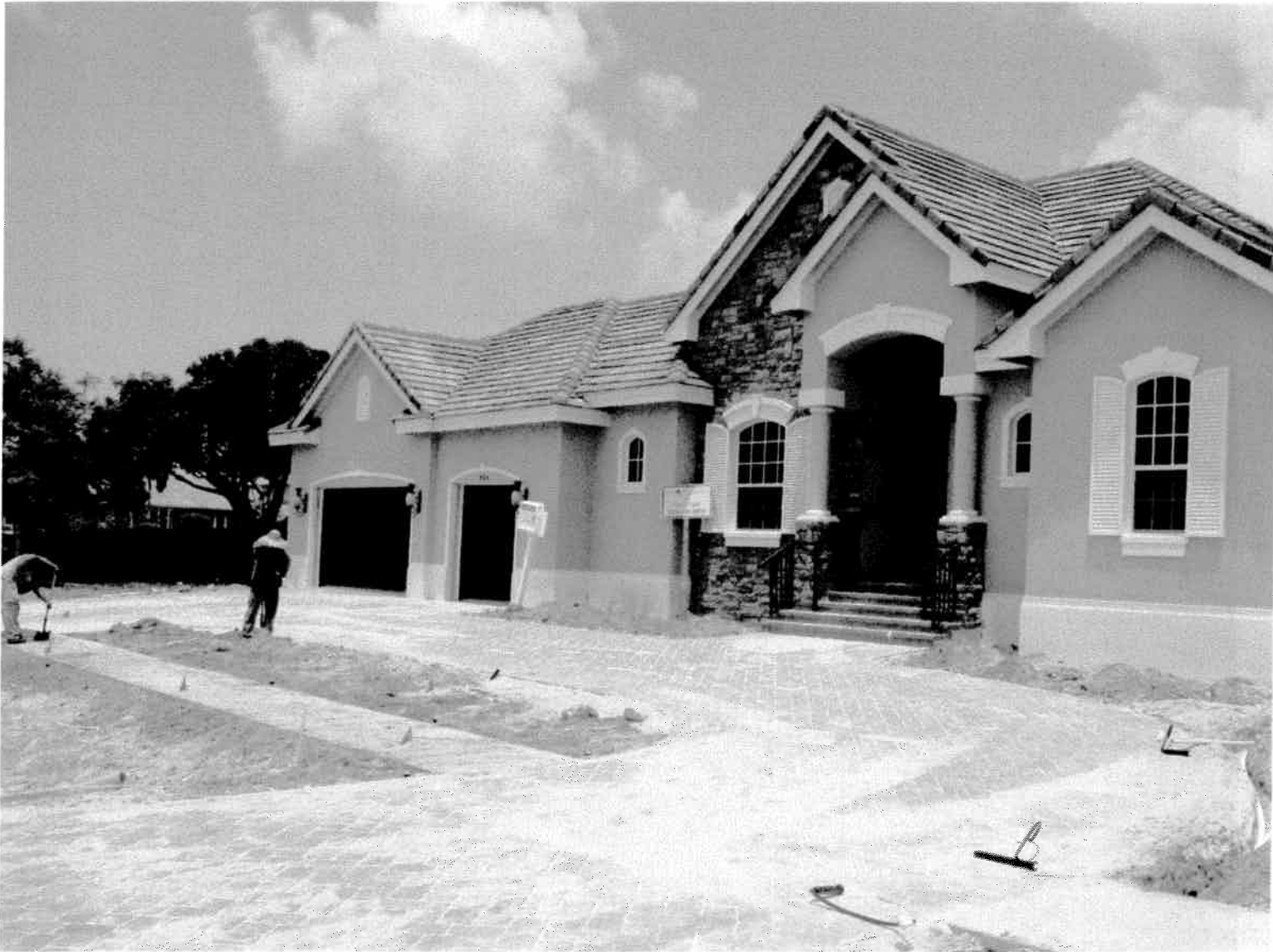
FRONT VIEW LOOKING NORTH WEST

If submitting more photographs than will fit on the preceding page, affix the additional photographs below. Identify a photograph with: date taken; "Front View" and "Rear View"; and, if required, "Right Side View" and "Left Side View."