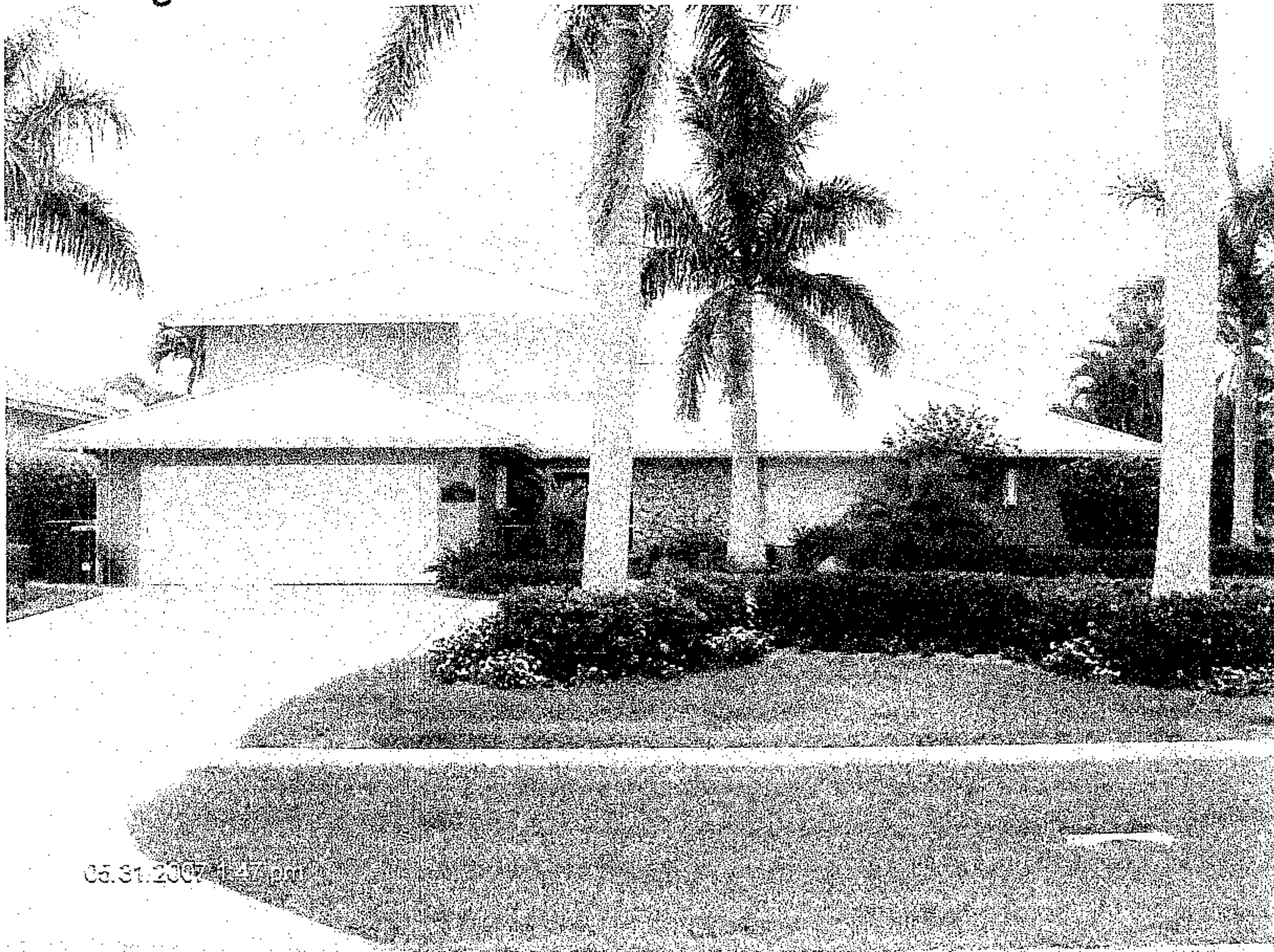
Front View 5/31/07

If using the Elevation Certificate to obtain NFIP flood insurance, affix at least two building photographs below according to the instructions for Item A6. Identify all photographs with: date taken; "Front View" and "Rear View"; and, if required, "Right Side View" and "Left Side View." If submitting more photographs than will fit on this page, use the Continuation Page, following.