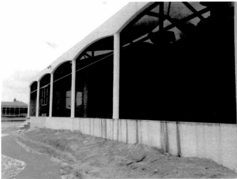
Rear View 4/23/2012