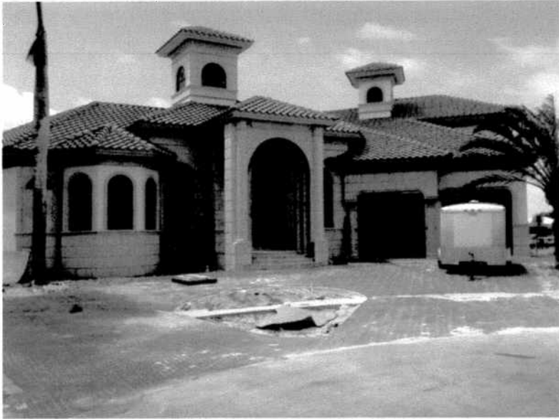
Front View 4/23/2012

If using the Elevation Certificate to obtain NFIP flood insurance, affix at least two building photographs below according to the instructions for Item A6. Identify all photographs with: date taken; "Front View" and "Rear View"; and, if required, "Right Side View" and "Left Side View." If submitting more photographs than will fit on this page, use the Continuation Page, following.