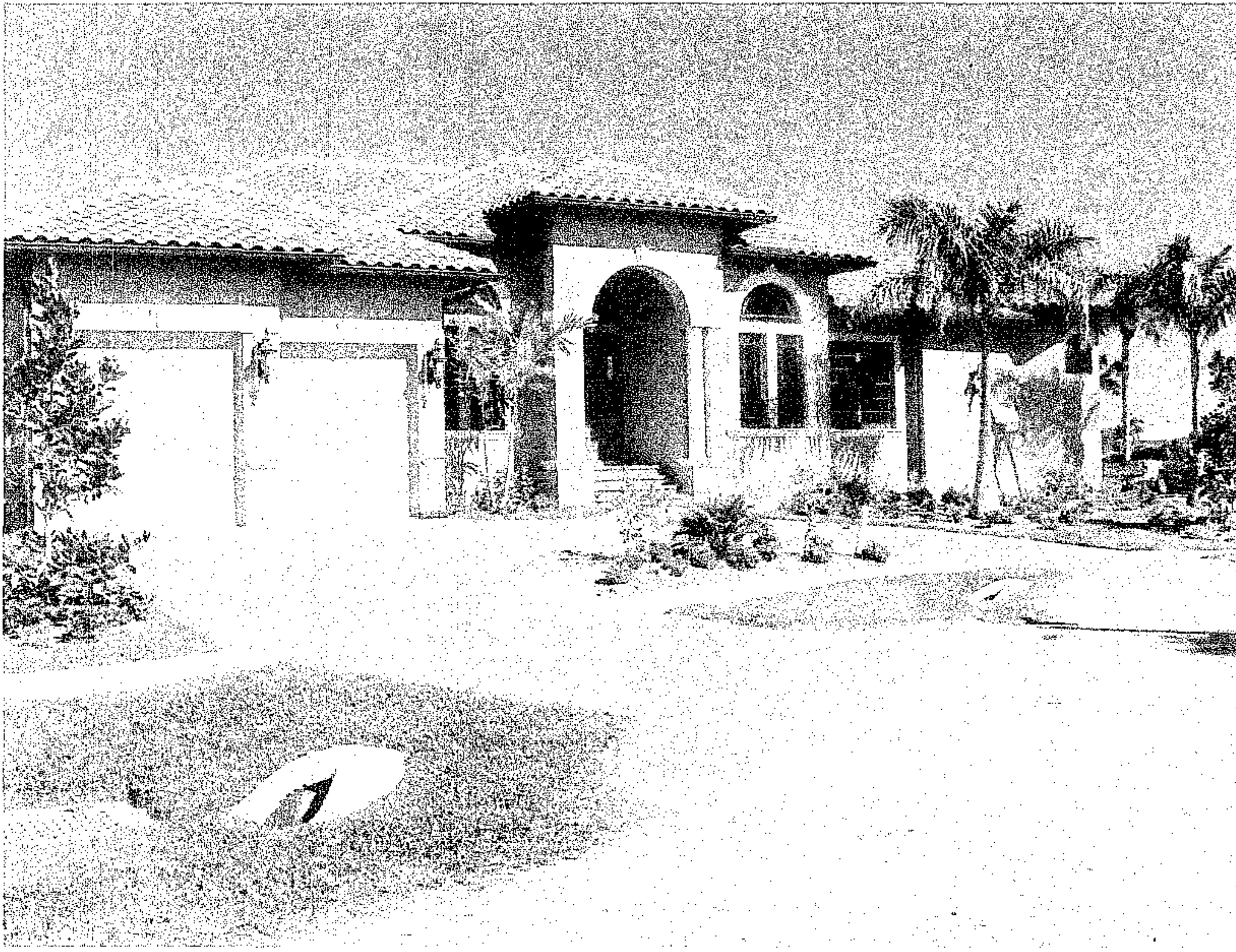
Front View 01/25/08

If using the Elevation Certificate to obtain NFIP flood insurance, affix at least two building photographs below according to the instructions for Item A6. Identify all photographs with: date taken; "Front View" and "Rear View"; and, if required, "Right Side View" and "Left Side View." If submitting more photographs than will fit on this page, use the Continuation Page, following.