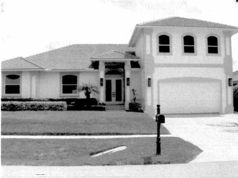
Front View 4/29/2011

If using the Elevation Certificate to obtain NFIP flood insurance, affix at least two building photographs below according to the instructions for Item A6. Identify all photographs with: date taken; "Front View" and "Rear View"; and, if required, "Right Side View" and "Left Side View." If submitting more photographs than will fit on this page, use the Continuation Page, following.