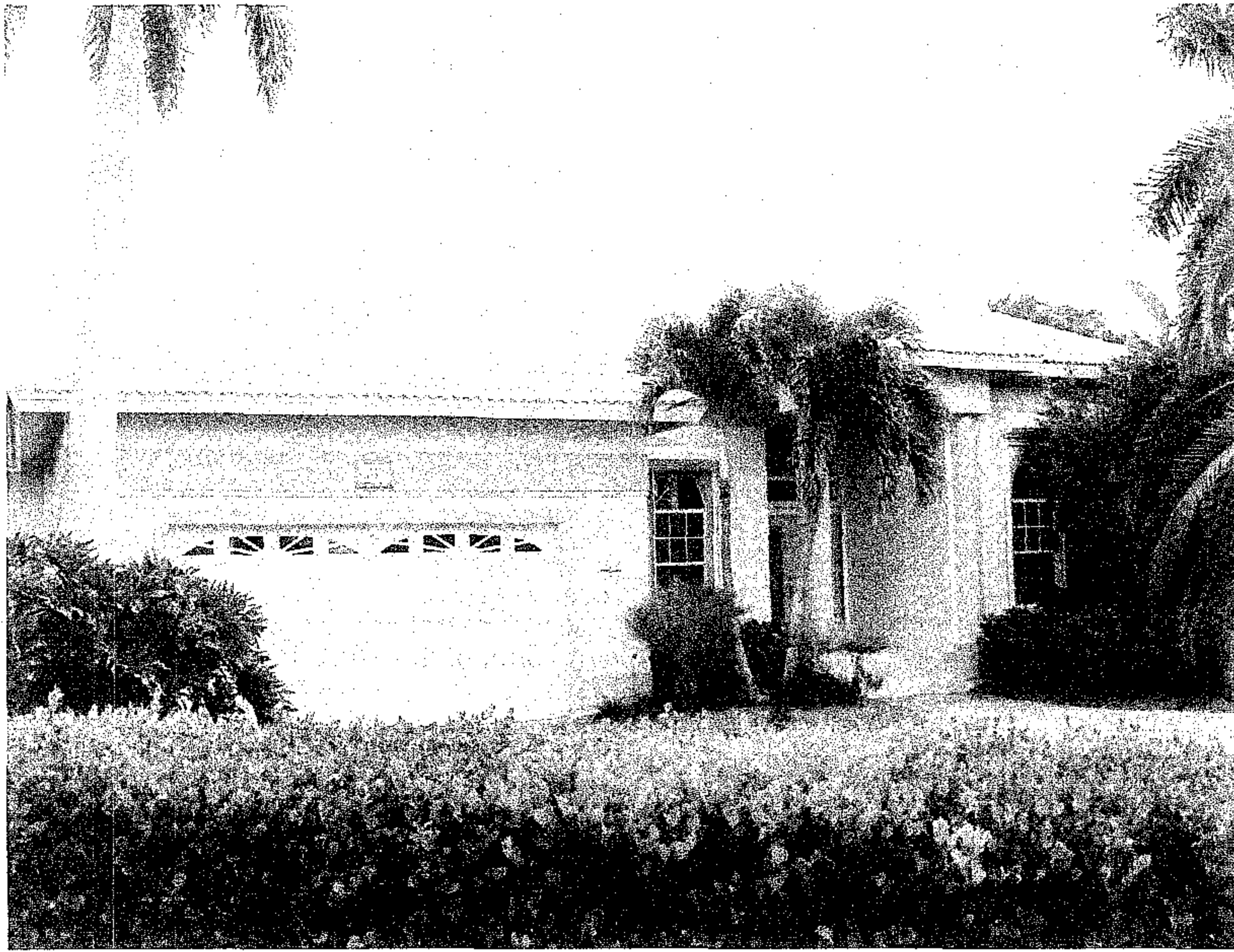
Front View 02/19/08

If using the Elevation Certificate to obtain NFIP flood insurance, affix at least two building photographs below according to the instructions for Item A6. Identify all photographs with: date taken; "Front View" and "Rear View"; and, if required, "Right Side View" and "Left Side View." If submitting more photographs than will fit on this page, use the Continuation Page, following.