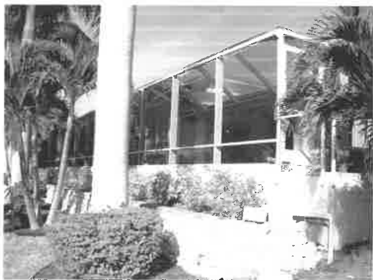
REAR VIEW (looking Northeast)