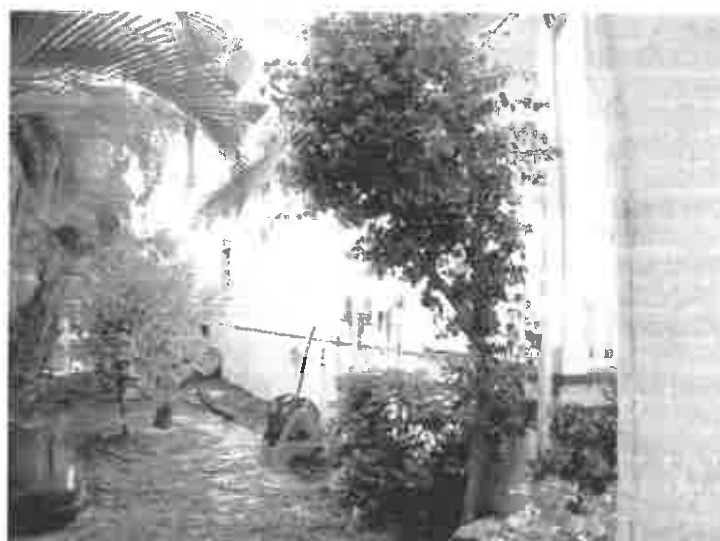
LEFT SIDE (from front, looking Northwest)