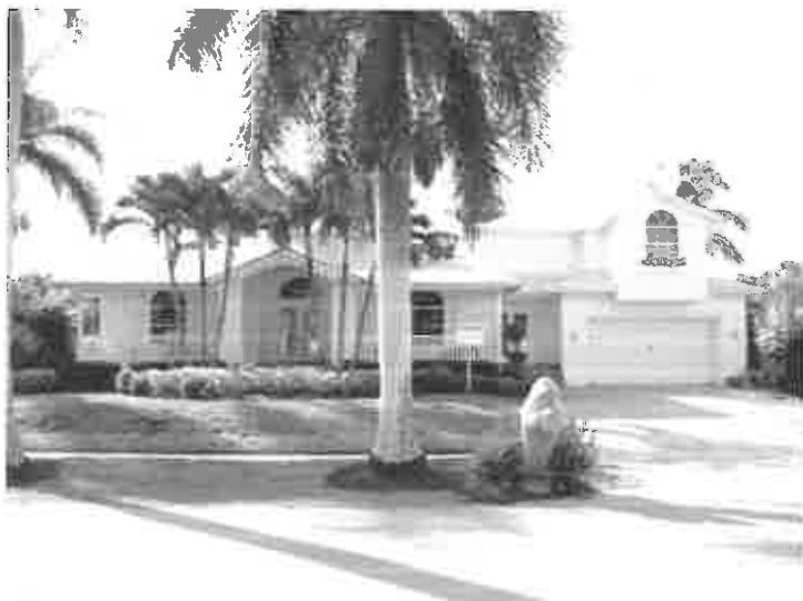
FRONT VIEW (looking Southwest)