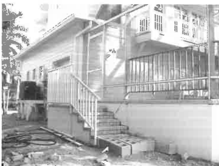
RIGHT SIDE (from rear, looking Southeast)