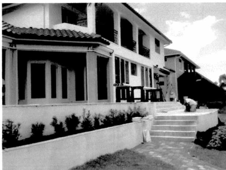
REAR VIEW 4/23/2012