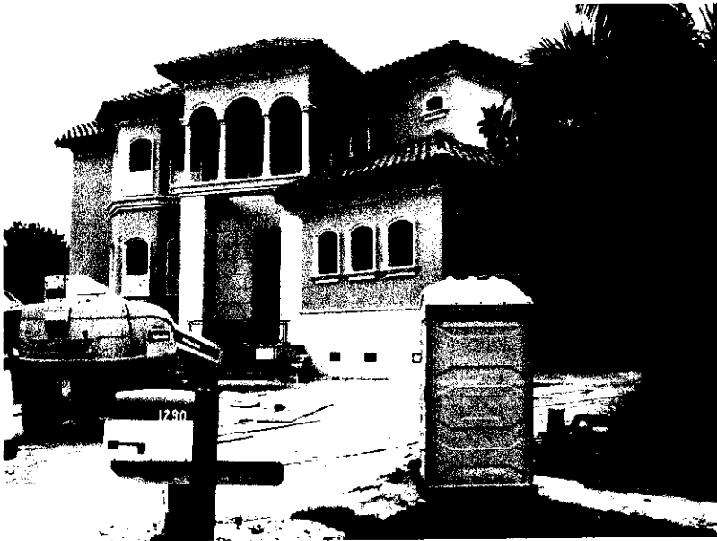
FRONT VIEW 1-17-2011

If using the Elevation Certificate to obtain NFIP flood insurance, affix at least two building photographs below according to the instructions for Item A6. Identify all photographs with: date taken; "Front View" and "Rear View"; and, if required, "Right Side View" and "Left Side View." If submitting more photographs than will fit on this page, use the Continuation Page, following.