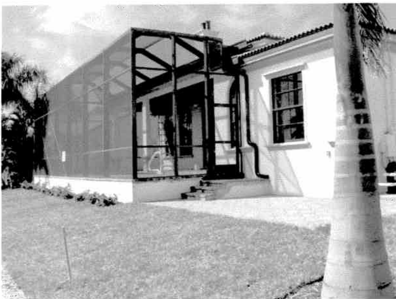
Rear View 8/21/2009