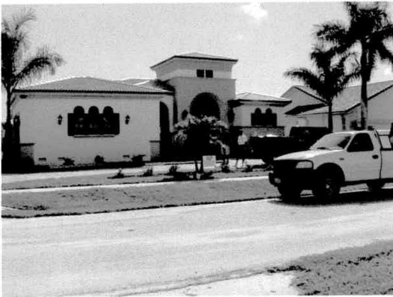
Front View 8/21/2009

If using the Elevation Certificate to obtain NFIP flood insurance, affix at least two building photographs below according to the instructions for Item A6. Identify all photographs with: date taken; "Front View" and "Rear View"; and, if required, "Right Side View" and "Left Side View." If submitting more photographs than will fit on this page, use the Continuation Page, following.