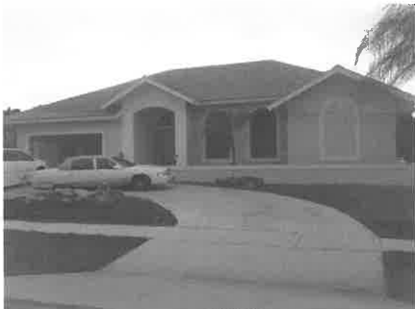
Front View 10/26/2012

If using the Elevation Certificate to obtain NFIP flood insurance, affix at least two building photographs below according to the instructions for Item A6. Identify all photographs with: date taken; "Front View" and "Rear View"; and, if required, "Right Side View" and "Left Side View." If submitting more photographs than will fit on this page, use the Continuation Page, following.