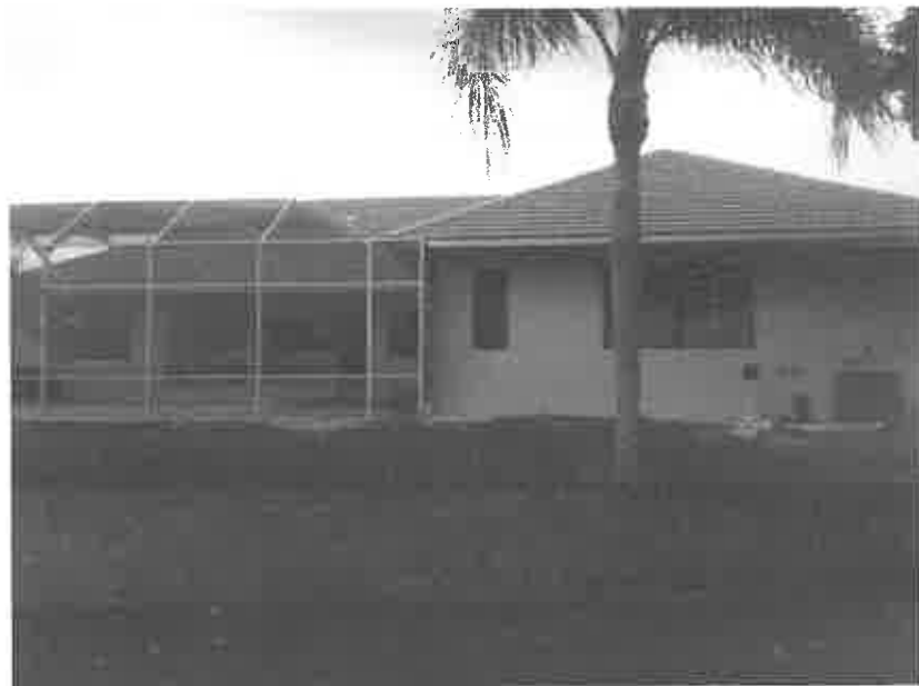
Rear View 3/26/2012