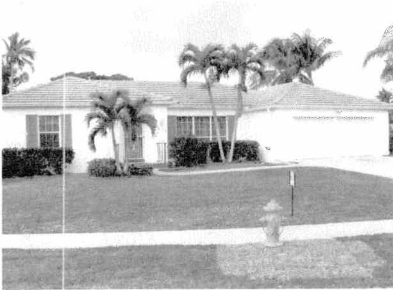
Front View 3/19/2009

If using the Elevation Certificate to obtain NFIP flood insurance, affix at least two building photographs below according to the instructions for Item A6. Identify all photographs with: date taken; "Front View" and "Rear View"; and, if required, "Right Side View" and "Left Side View." If submitting more photographs than will fit on this page, use the Continuation Page, following.