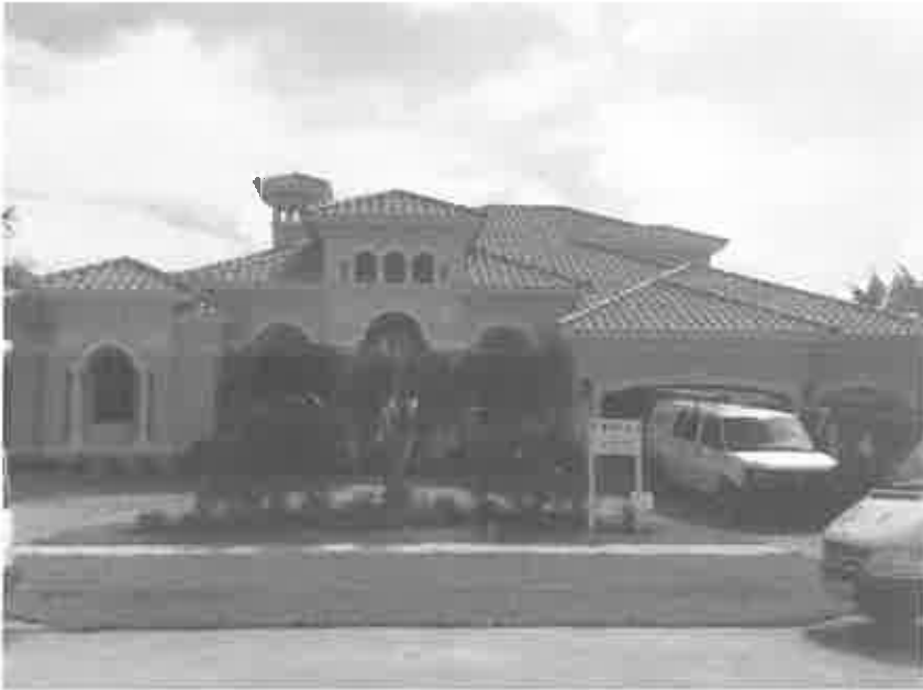
Front View 10/18/2012

If using the Elevation Certificate to obtain NFIP flood insurance, affix at least two building photographs below according to the instructions for Item A6. Identify all photographs with: date taken; "Front View" and "Rear View"; and, if required, "Right Side View" and "Left Side View." If submitting more photographs than will fit on this page, use the Continuation Page, following.