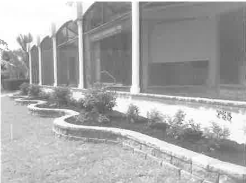
Rear View 10/18/2012