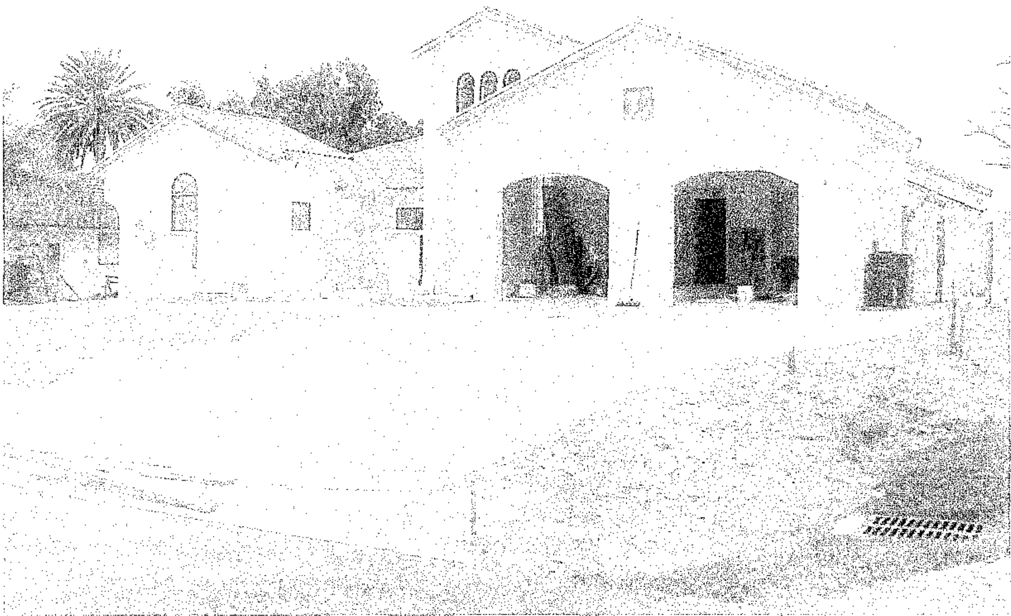
Front View 01/24/08

If using the Elevation Certificate to obtain NFIP flood insurance, affix at least two building photographs below according to the instructions for Item A6. Identify all photographs with: date taken; "Front View" and "Rear View"; and, if required, "Right Side View" and "Left Side View." If submitting more photographs than will fit on this page, use the Continuation Page, following.