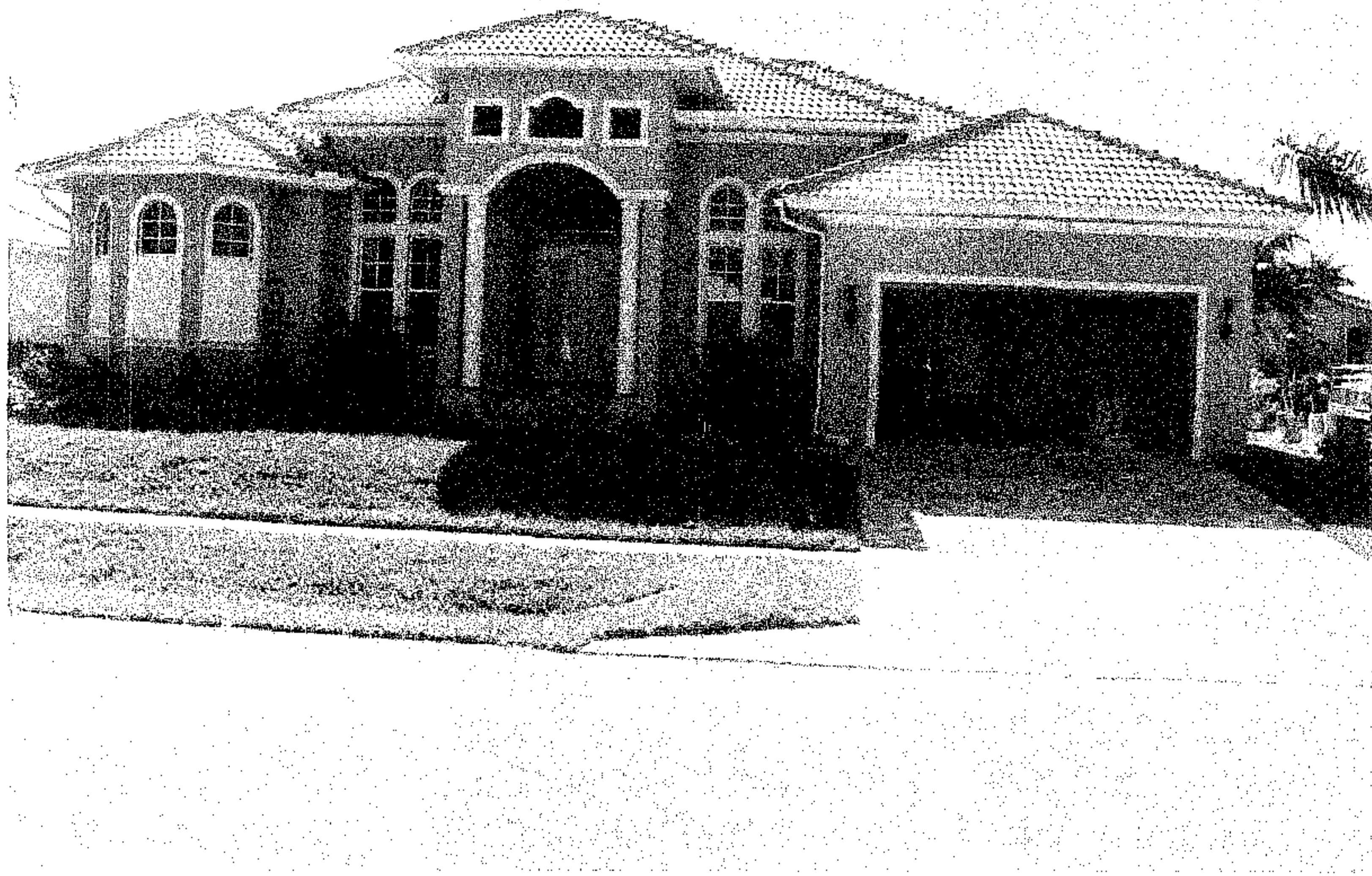
Front View 12/07/07

If using the Elevation Certificate to obtain NFIP flood insurance, affix at least two building photographs below according to the instructions for Item A6. Identify all photographs with: date taken; "Front View" and "Rear View"; and, if required, "Right Side View" and "Left Side View." If submitting more photographs than will fit on this page, use the Continuation Page, following.