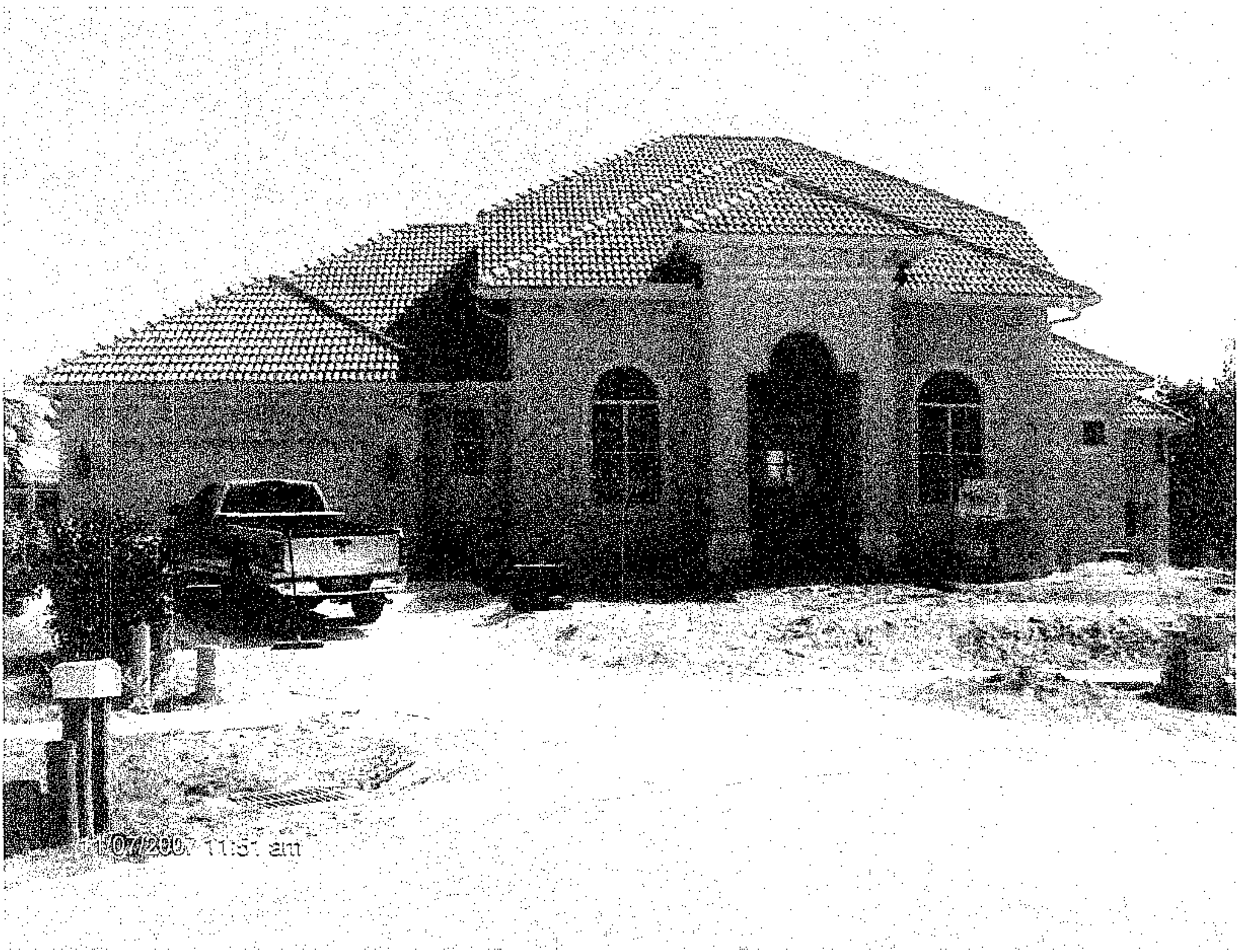
Front View 11/07/07

If using the Elevation Certificate to obtain NFIP flood insurance, affix at least two building photographs below according to the instructions for Item A6. Identify all photographs with: date taken; "Front View" and "Rear View"; and, if required, "Right Side View" and "Left Side View." If submitting more photographs than will fit on this page, use the Continuation Page, following.