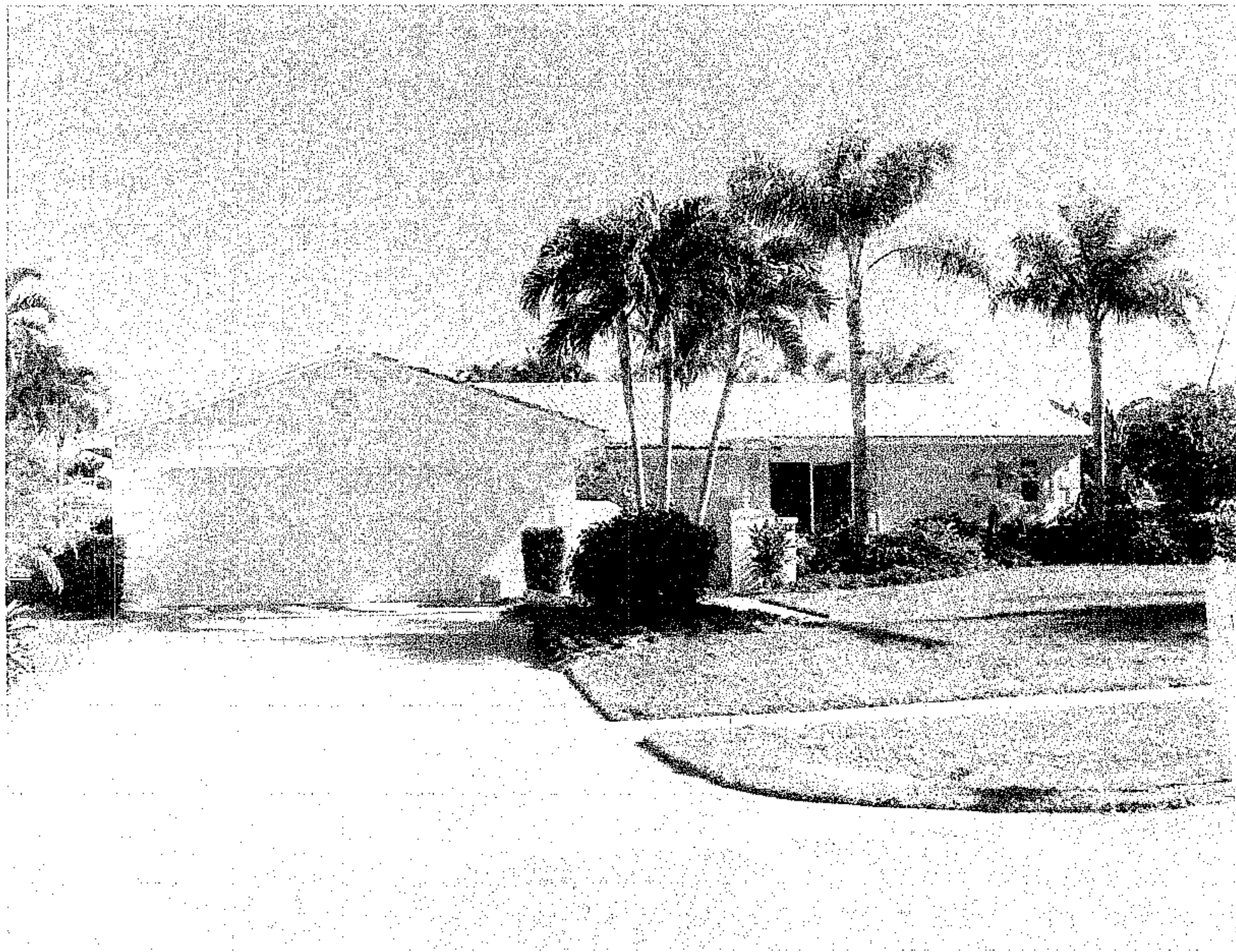
Front View 12/20/07

If using the Elevation Certificate to obtain NFIP flood insurance, affix at least two building photographs below according to the instructions for Item A6. Identify all photographs with: date taken; "Front View" and "Rear View"; and, if required, "Right Side View" and "Left Side View." If submitting more photographs than will fit on this page, use the Continuation Page, following.