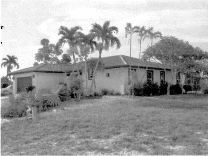
Front view taken 07/26/2011