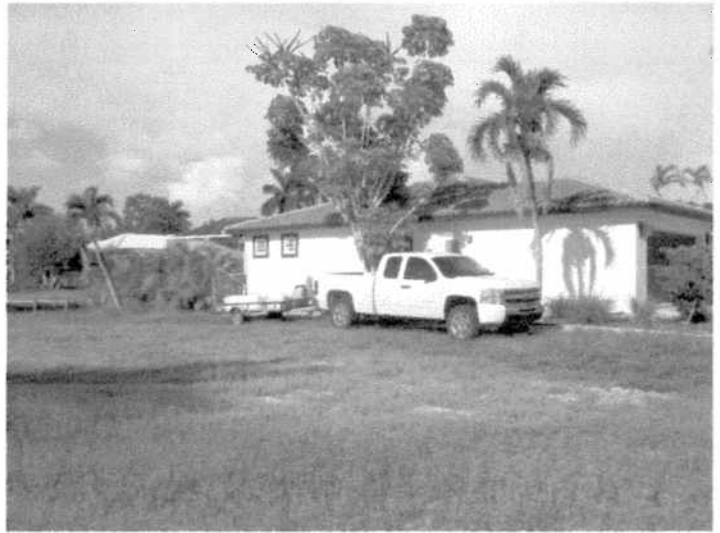
Rear view taken 07/26/2011