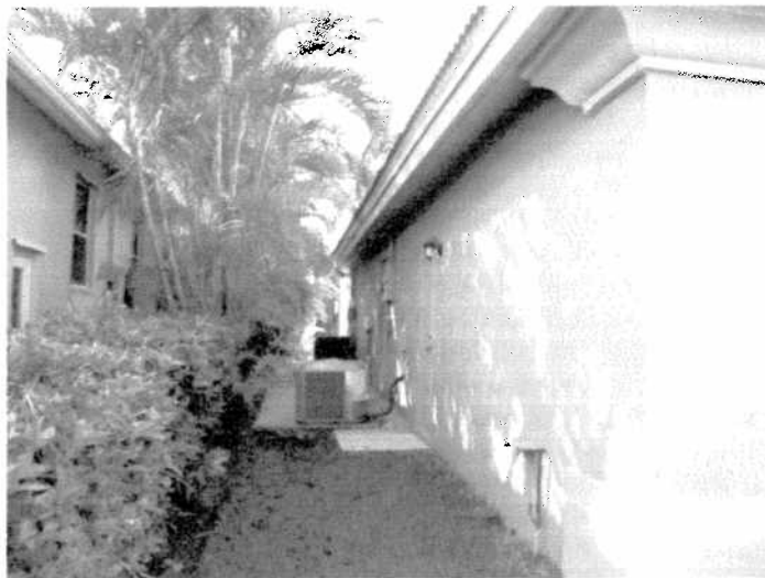
LEFT SIDE (from front, looking Southeast)