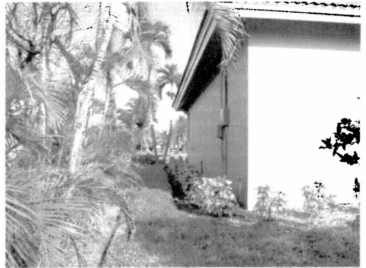
RIGHT SIDE (from rear, looking Northwest)