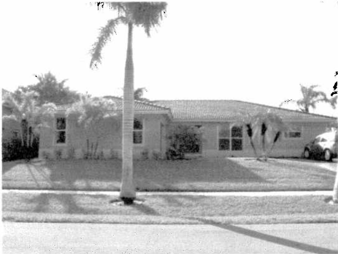
FRONT VIEW (looking Southeast)

If using the Elevation Certificate to obtain NFIP flood insurance, affix at least two building photographs below according to the instructions for Item A6. Identify all photographs with: date taken, "Front View" and "Rear View"; and, if required, "Right Side View" and "Left Side View." If submitting more photographs than will fit on this page, use the Continuation Page on the reverse.