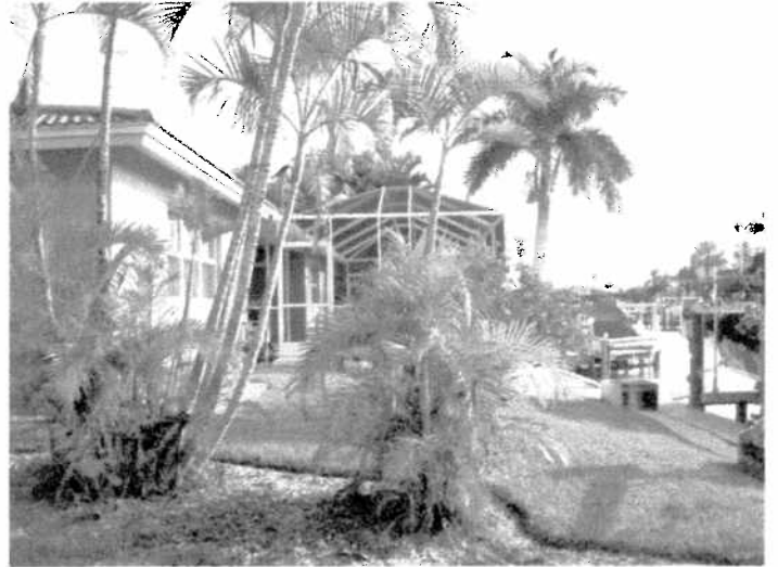
REAR VIEW (looking Northeast)