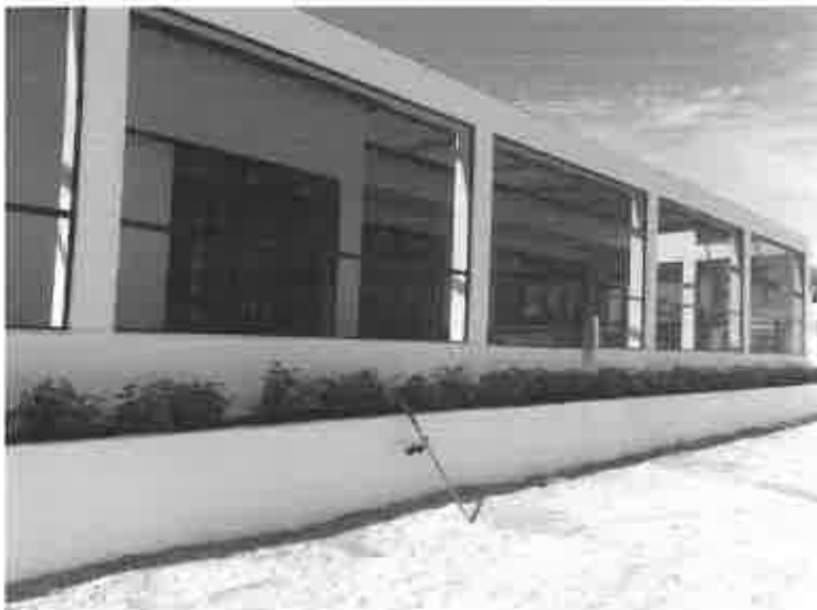
REAR VIEW DATE TAKEN: 11/29/12