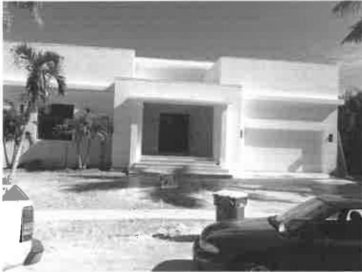
FRONT VIEW DATE TAKEN: 11/29/12

If using the Elevation Certificate to obtain NFIP flood insurance, affix at least two building photographs below according to the instructions for Item A6. Identify all photographs with: date taken; "Front View" and "Rear View"; and, if required, "Right Side View" and "Left Side View." If submitting more photographs than will fit on this page, use the Continuation Page on the reverse.