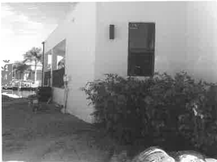
LEFT SIDE VIEW DATE TAKEN: 11/29/12