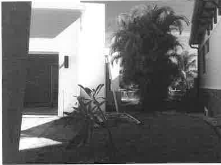
RIGHT SIDE VIEW DATE TAKEN: 11/29/12

If submitting more photographs than will fit on the preceding page, affix the additional photographs below. Identify all photographs with: date taken; "Front View" and "Rear View"; and, if required, "Right Side View" and "Left Side View."