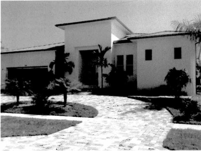
Front View 9/14/2011

If using the Elevation Certificate to obtain NFIP flood insurance, affix at least two building photographs below according to the instructions for Item A6. Identify all photographs with: date taken; "Front View" and "Rear View"; and, if required, "Right Side View" and "Left Side View." If submitting more photographs than will fit on this page, use the Continuation Page, following.