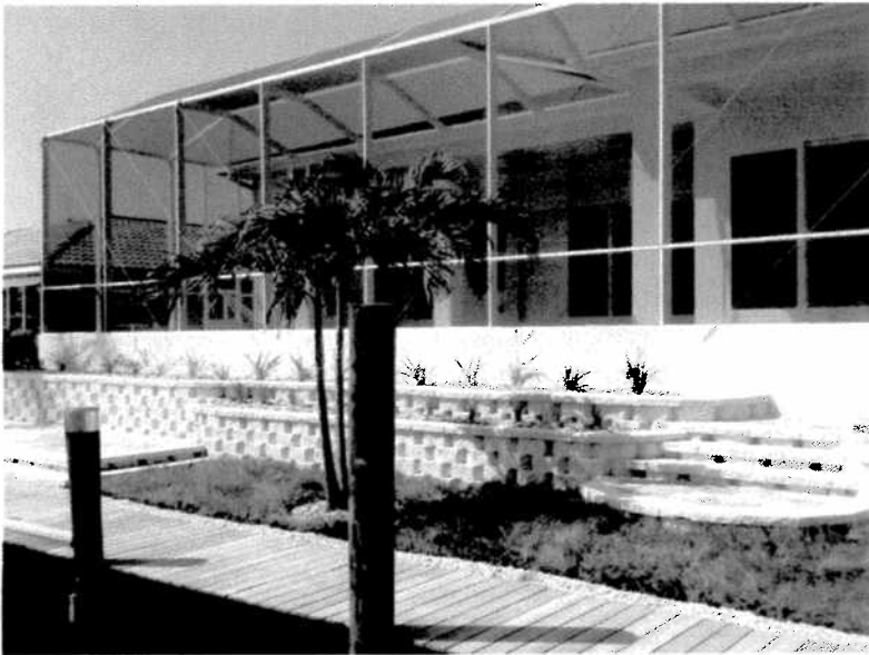
Rear View 9/14/2011