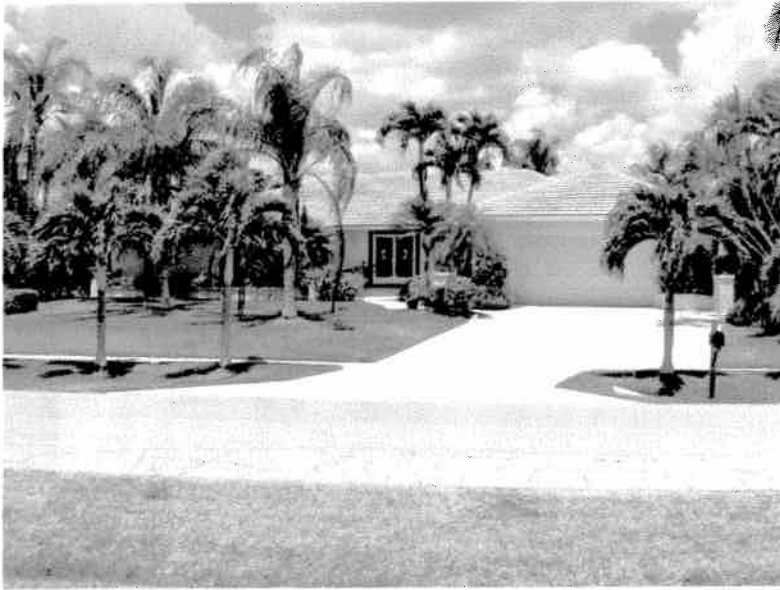
Front View 4/30/2009

If using the Elevation Certificate to obtain NFIP flood insurance, affix at least two building photographs below according to the instructions for Item A6. Identify all photographs with: date taken; "Front View" and "Rear View"; and, if required, "Right Side View" and "Left Side View." If submitting more photographs than will fit on this page, use the Continuation Page, following.