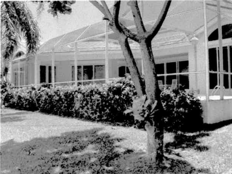
Rear View 4/30/2009