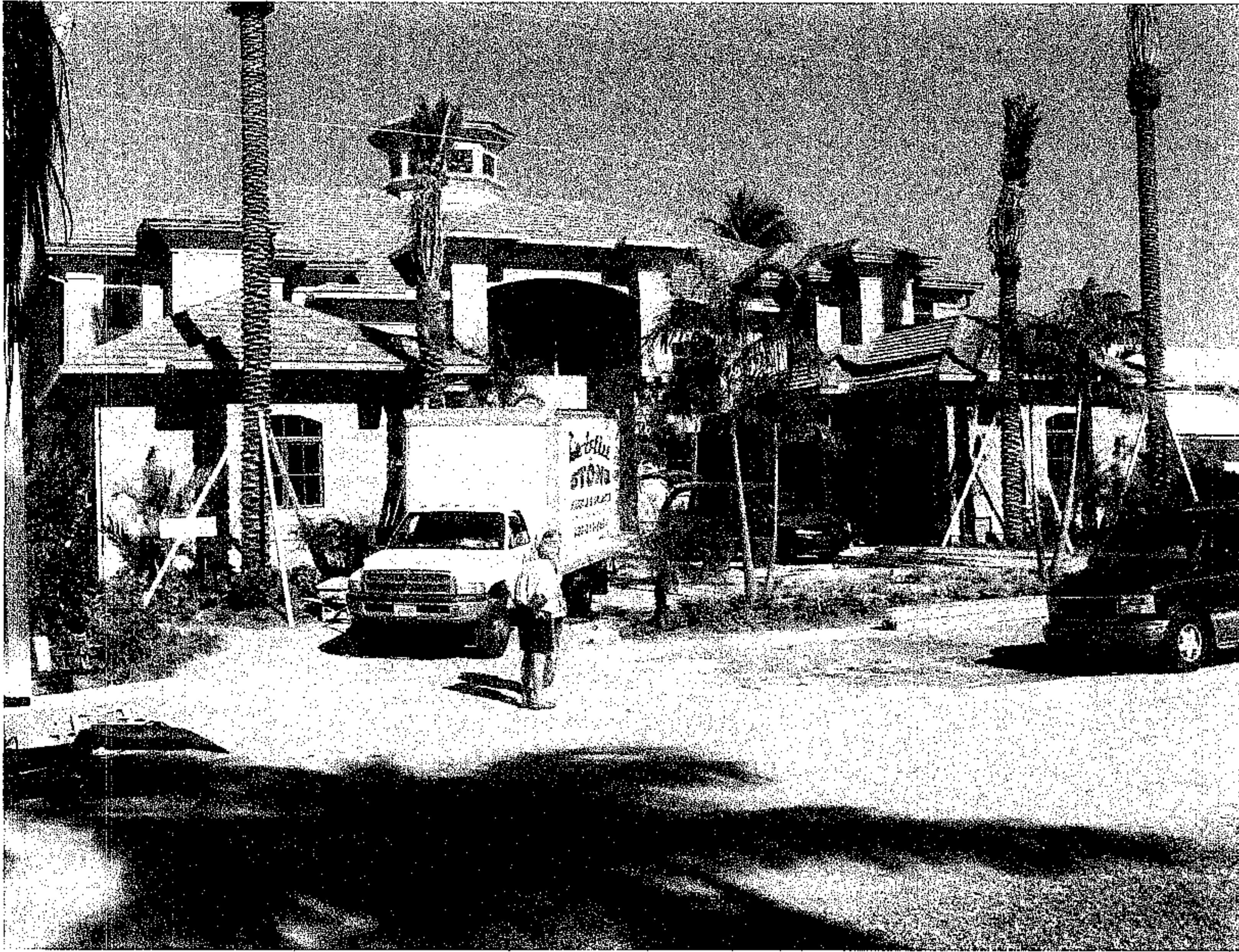
Front View 1/31/07

If using the Elevation Certificate to obtain NFIP flood insurance, affix at least two building photographs below according to the instructions for Item A6. Identify all photographs with: date taken; "Front View" and "Rear View"; and, if required, "Right Side View" and "Left Side View." If submitting more photographs than will fit on this page, use the Continuation Page, following.