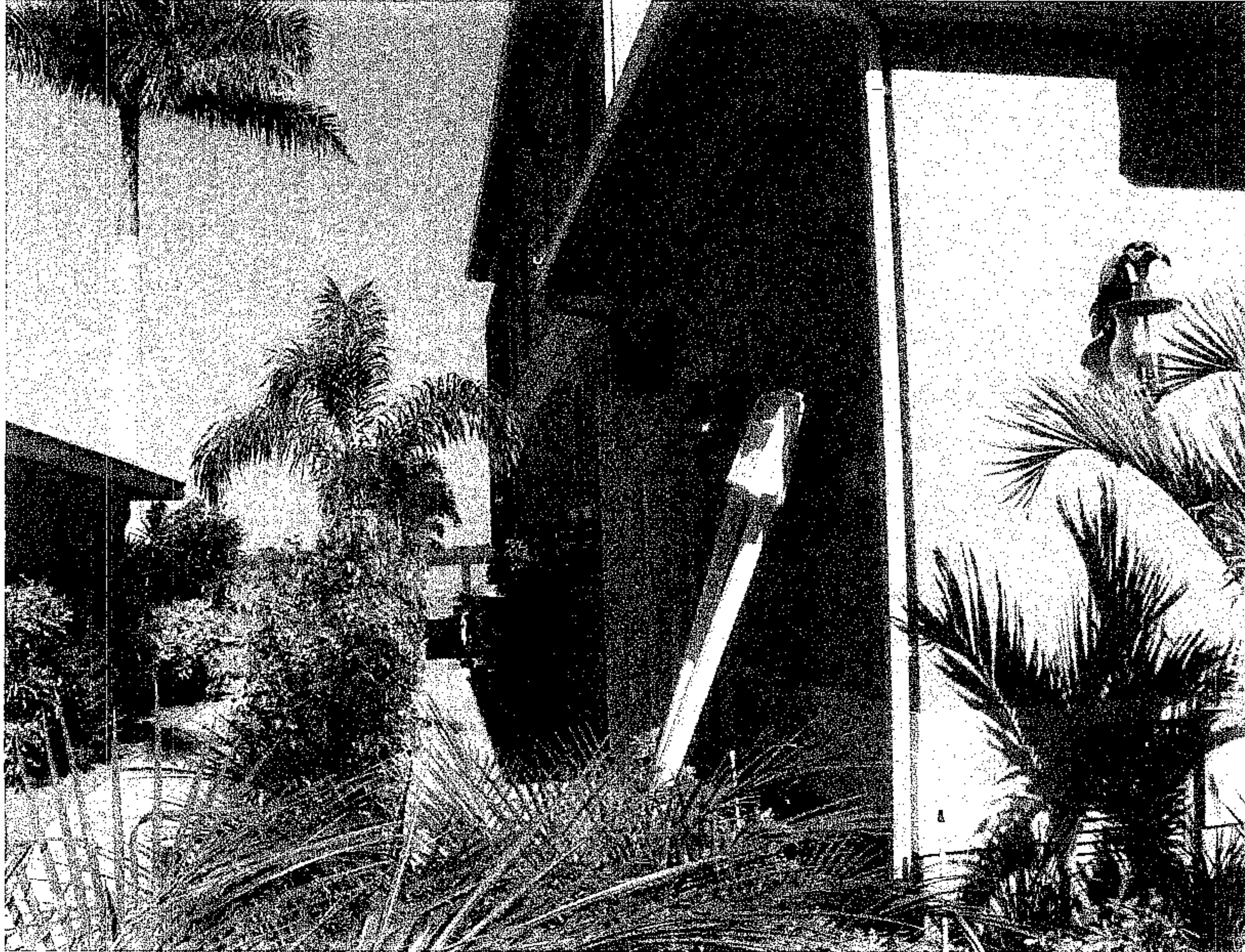
Left Side View 1/31/07

If using the Elevation Certificate to obtain NFIP flood insurance, affix at least two building photographs below according to the instructions for Item A6. Identify all photographs with: date taken; "Front View" and "Rear View"; and, if required, "Right Side View" and "Left Side View." If submitting more photographs than will fit on this page, use the Continuation Page, following.