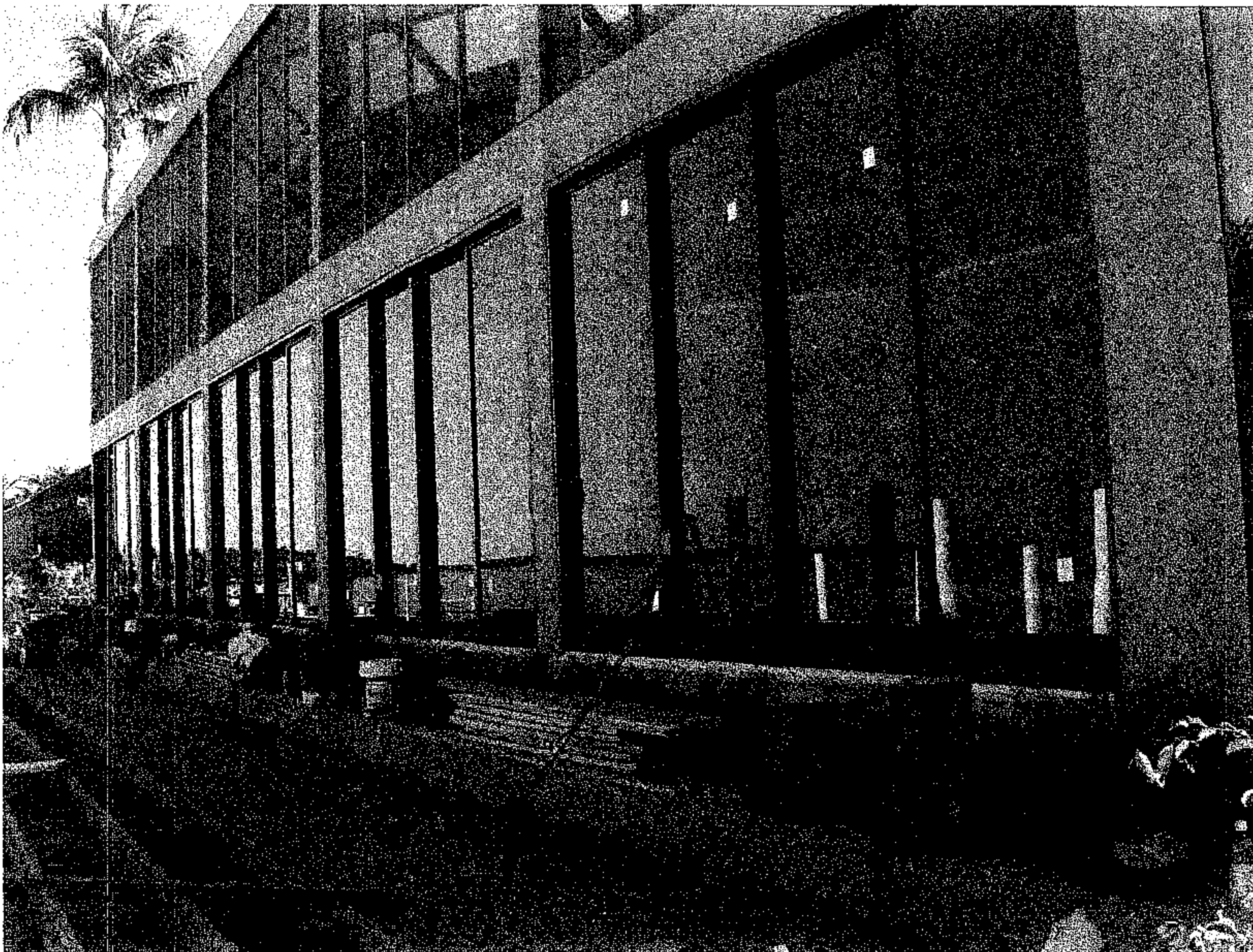
Rear View 1/31/07