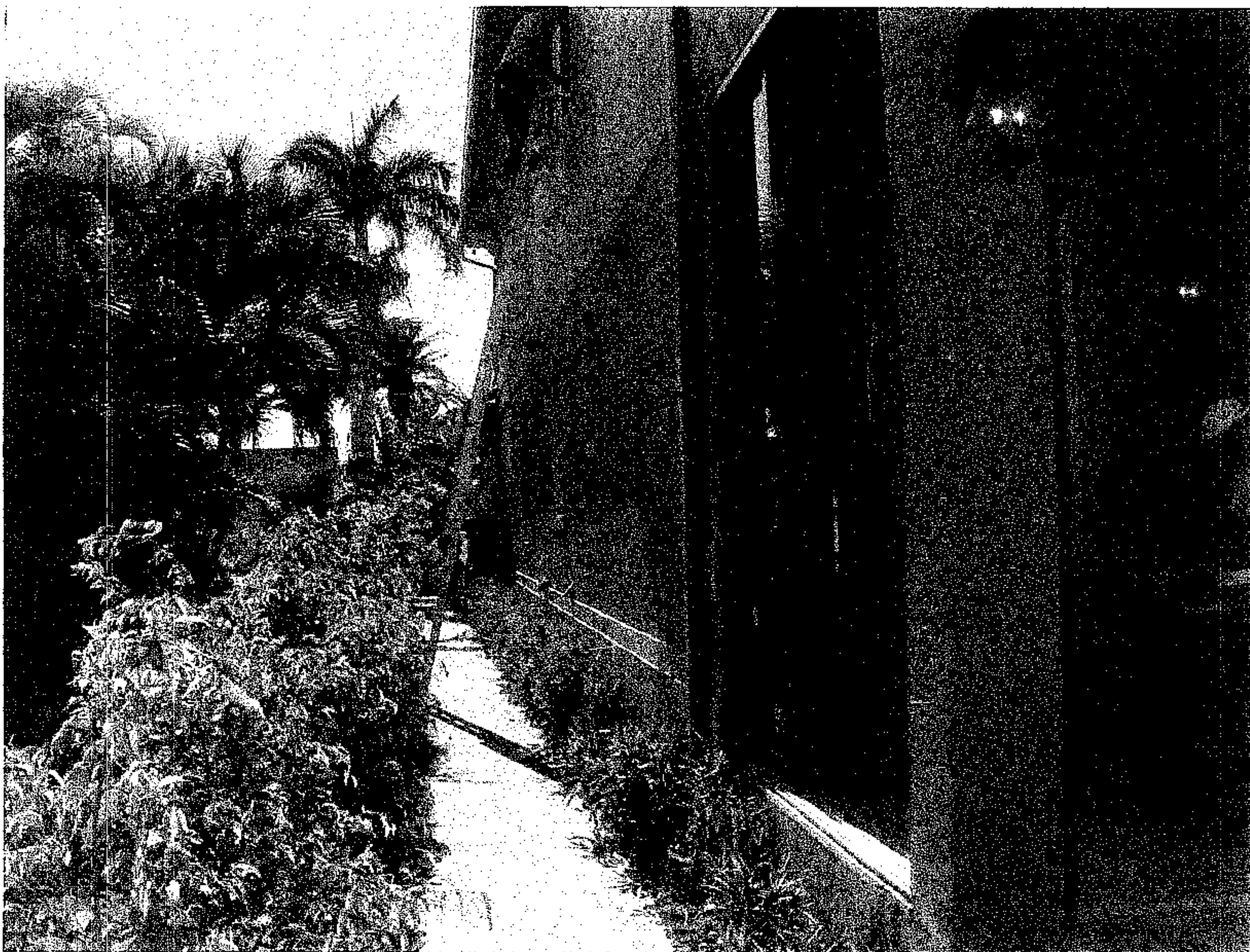
Right Side View 1/31/07