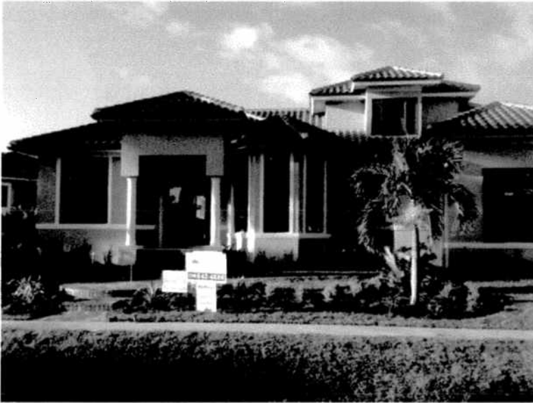
Front View 12/21/2011

If using the Elevation Certificate to obtain NFIP flood insurance, affix at least two building photographs below according to the instructions for Item A6. Identify all photographs with: date taken; "Front View" and "Rear View"; and, if required, "Right Side View" and "Left Side View." If submitting more photographs than will fit on this page, use the Continuation Page, following.