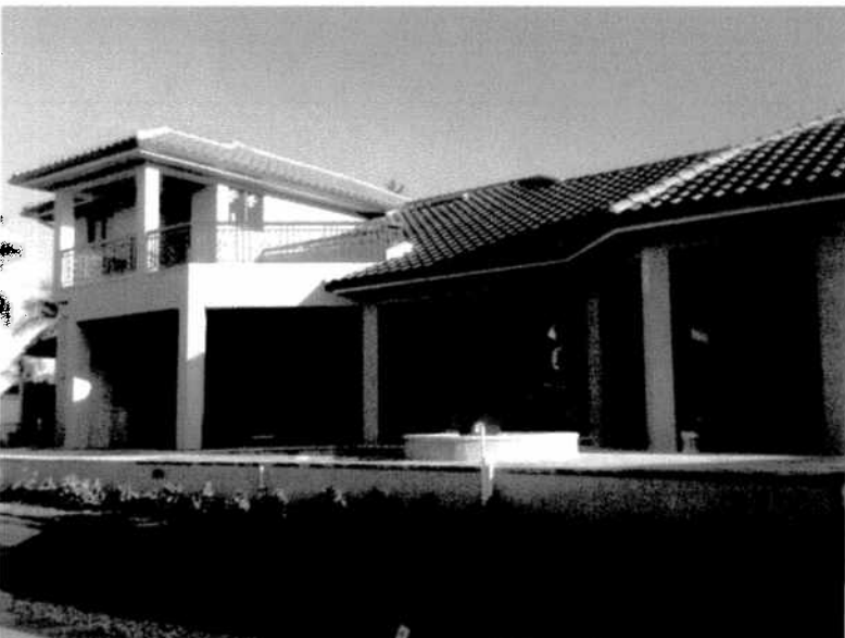
Rear View 12/21/2011