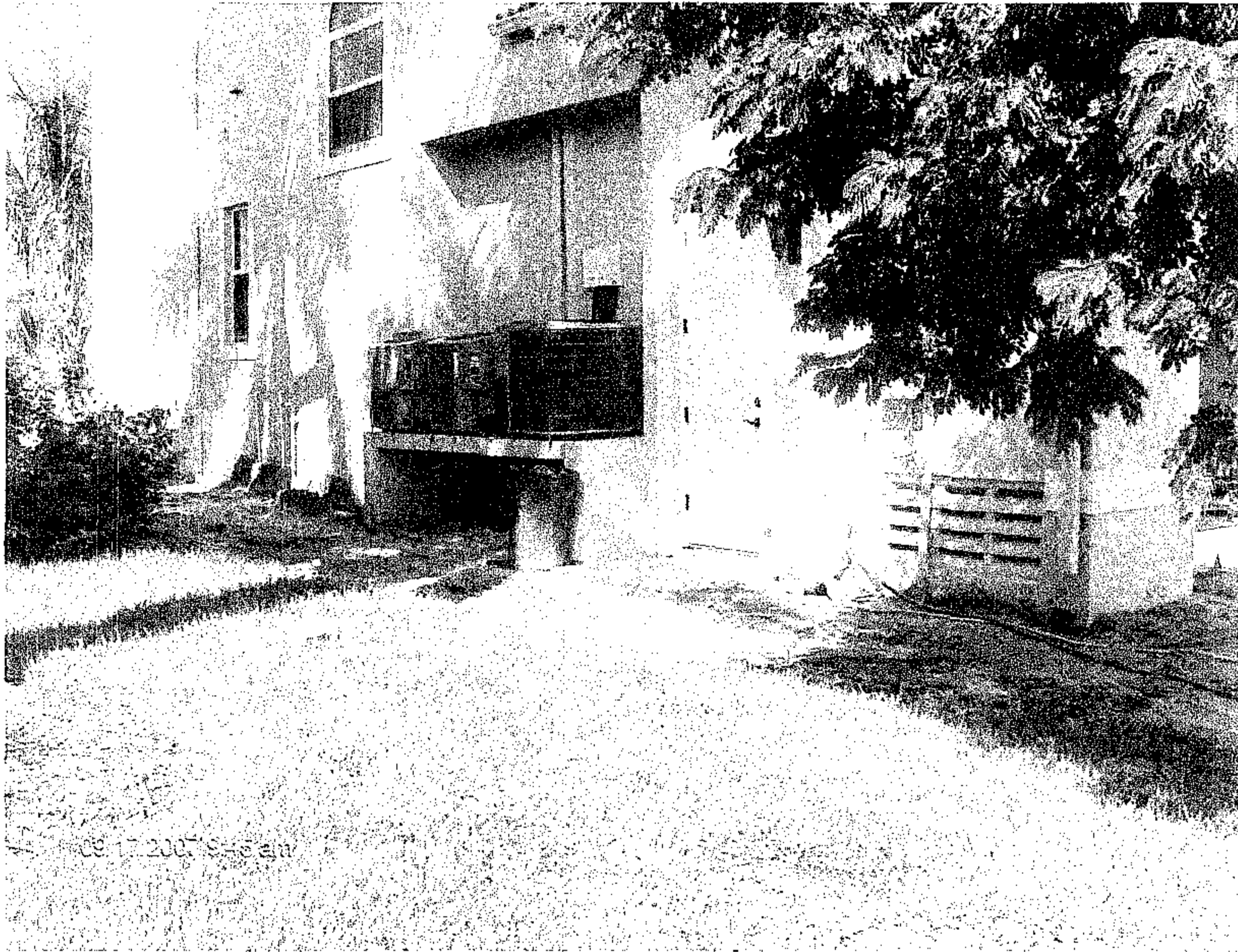
Left Side View 09/17/07

If using the Elevation Certificate to obtain NFIP flood insurance, affix at least two building photographs below according to the instructions for Item A6. Identify all photographs with: date taken; "Front View" and "Rear View"; and, if required, "Right Side View" and "Left Side View." If submitting more photographs than will fit on this page, use the Continuation Page, following.