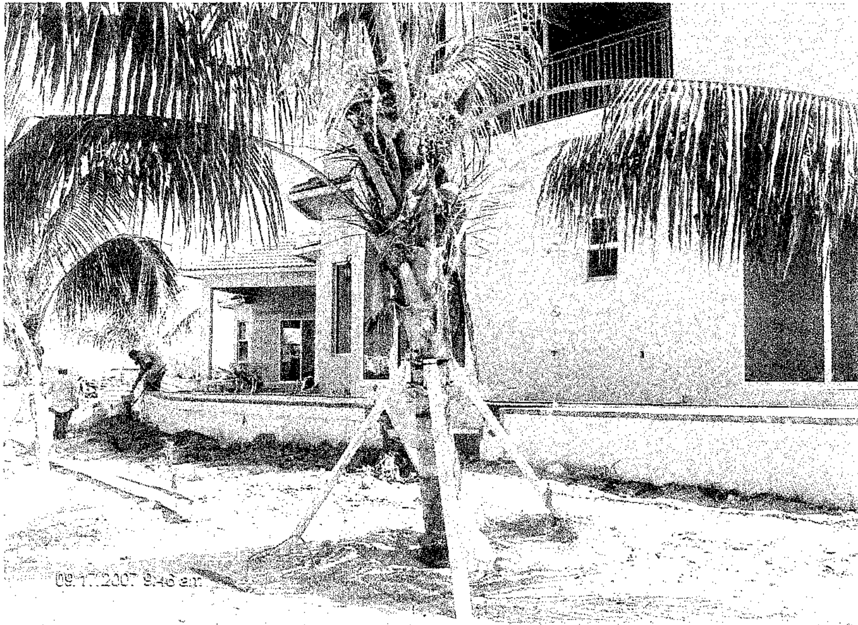
Rear View 09/17/07