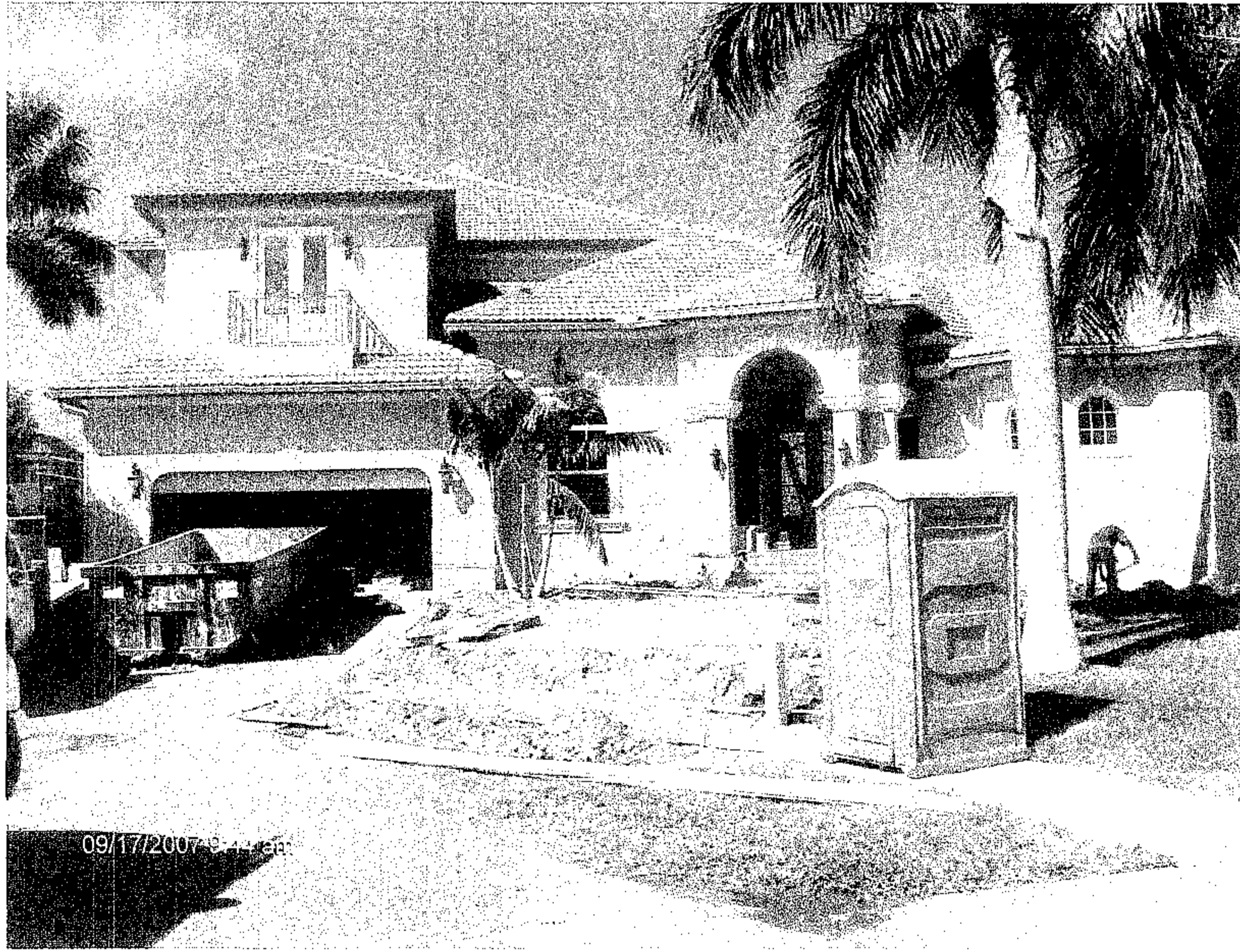
Front View 09/17/07

If using the Elevation Certificate to obtain NFIP flood insurance, affix at least two building photographs below according to the instructions for Item A6. Identify all photographs with: date taken; "Front View" and "Rear View"; and, if required, "Right Side View" and "Left Side View." If submitting more photographs than will fit on this page, use the Continuation Page, following.