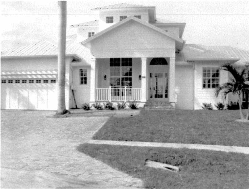
Front View 12/8/2009

If using the Elevation Certificate to obtain NFIP flood insurance, affix at least two building photographs below according to the instructions for Item A6. Identify all photographs with: date taken; "Front View" and "Rear View"; and, if required, "Right Side View" and "Left Side View." If submitting more photographs than will fit on this page, use the Continuation Page, following.