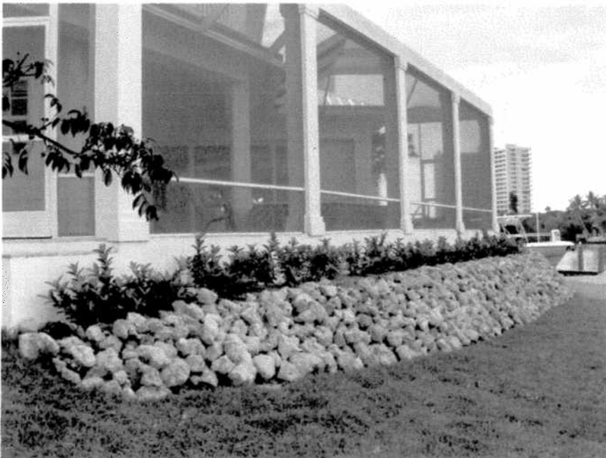
Rear View 12/8/2009