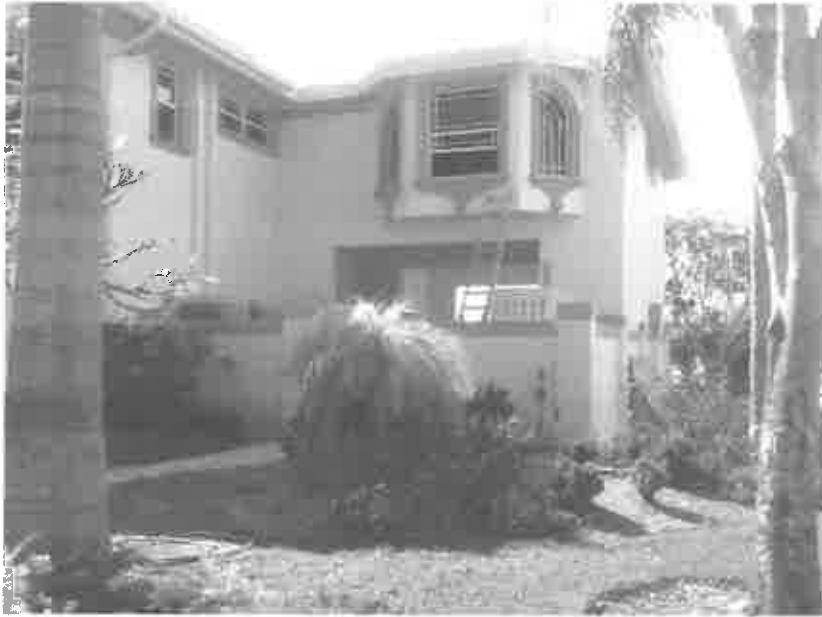
Front View 11/7/2012

If using the Elevation Certificate to obtain NFIP flood insurance, affix at least two building photographs below according to the instructions for Item A6. Identify all photographs with: date taken; "Front View" and "Rear View"; and, if required, "Right Side View" and "Left Side View." If submitting more photographs than will fit on this page, use the Continuation Page, following.