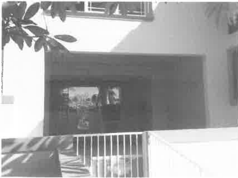
Rear View 11/7/2012