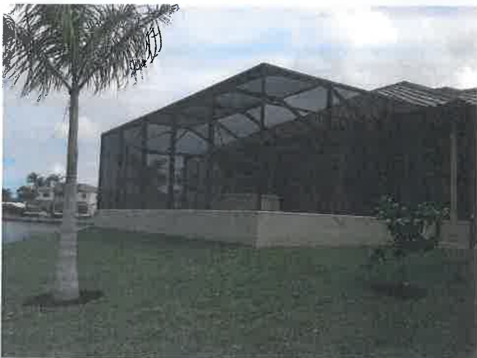
REAR VIEW - 05/29/2013