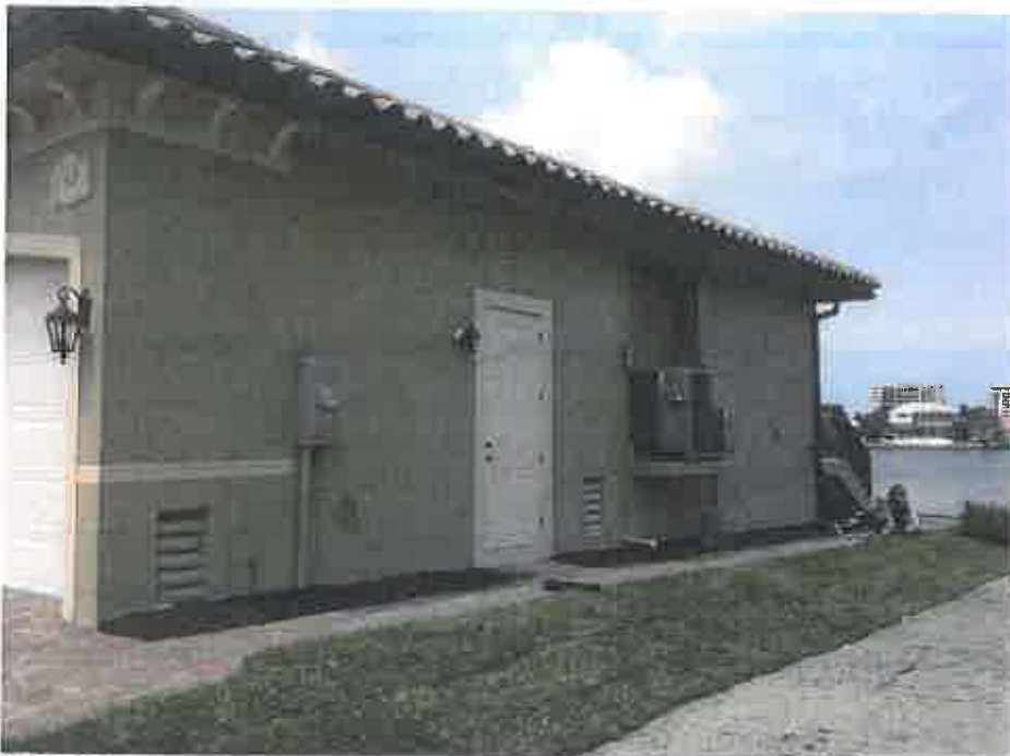
RIGHT SIDE VIEW - 05/29/2013