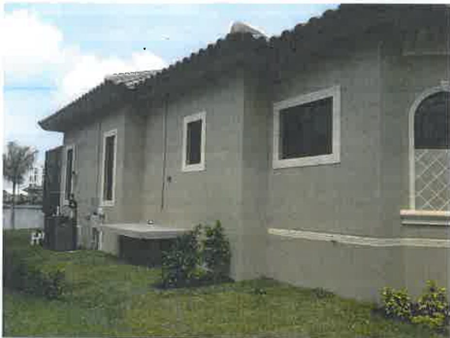
LEFT SIDE VIEW - 05/29/2013

If submitting more photographs than will fit on the preceding page, affix the additional photographs below. Identify all photographs with: date taken; "Front View" and "Rear View"; and, if required, "Right Side View" and "Left Side View." When applicable, photographs must show the foundation with representative examples of the flood openings or vents, as indicated in Section A8.