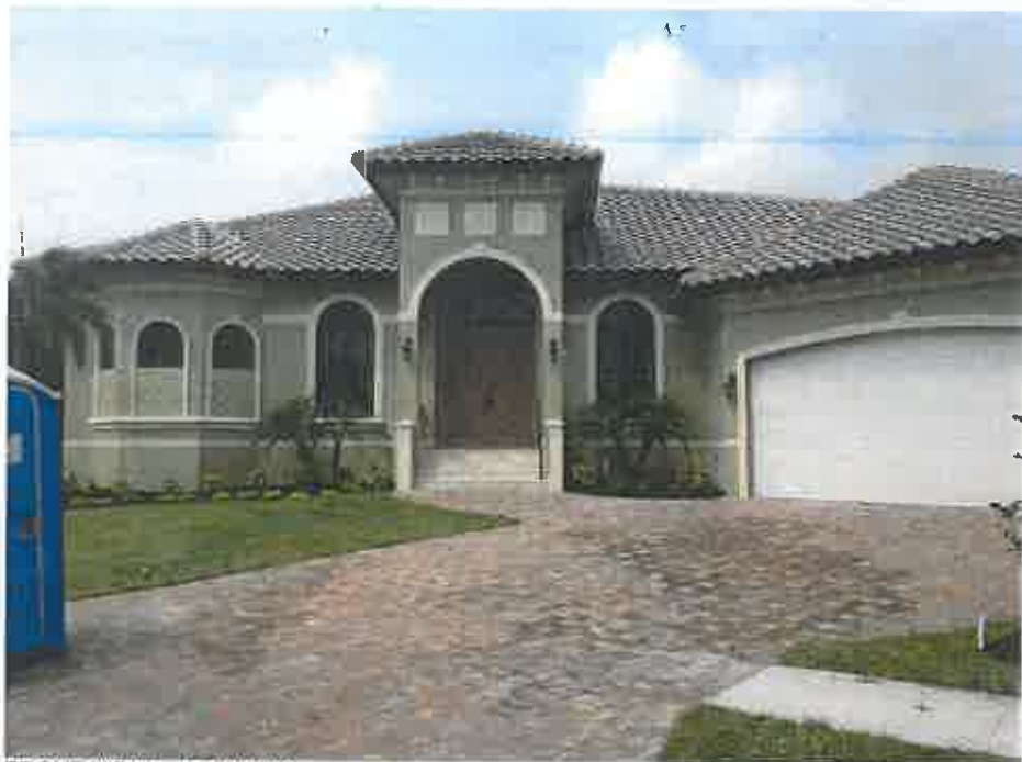
FRONT VIEW - 05/29/2013

If using the Elevation Certificate to obtain NFIP flood insurance, affix at least 2 building photographs below according to the instructions for Item A6. Identify all photographs with date taken; "Front View" and "Rear View"; and, if required, "Right Side View" and "Left Side View." When applicable, photographs must show the foundation with representative examples of the flood openings or vents, as indicated in Section A8. If submitting more photographs than will fit on this page, use the Continuation Page.