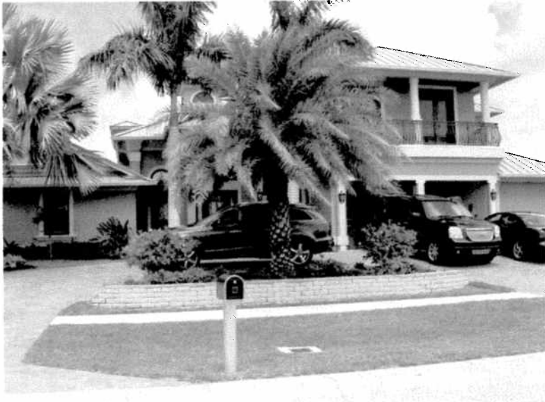
Front View 4/29/2011

If using the Elevation Certificate to obtain NFIP flood insurance, affix at least two building photographs below according to the instructions for Item A6. Identify all photographs with: date taken; "Front View" and "Rear View"; and, if required, "Right Side View" and "Left Side View." If submitting more photographs than will fit on this page, use the Continuation Page, following.