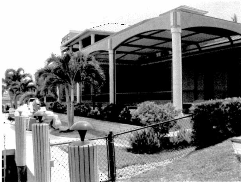
Rear View 4/29/2011