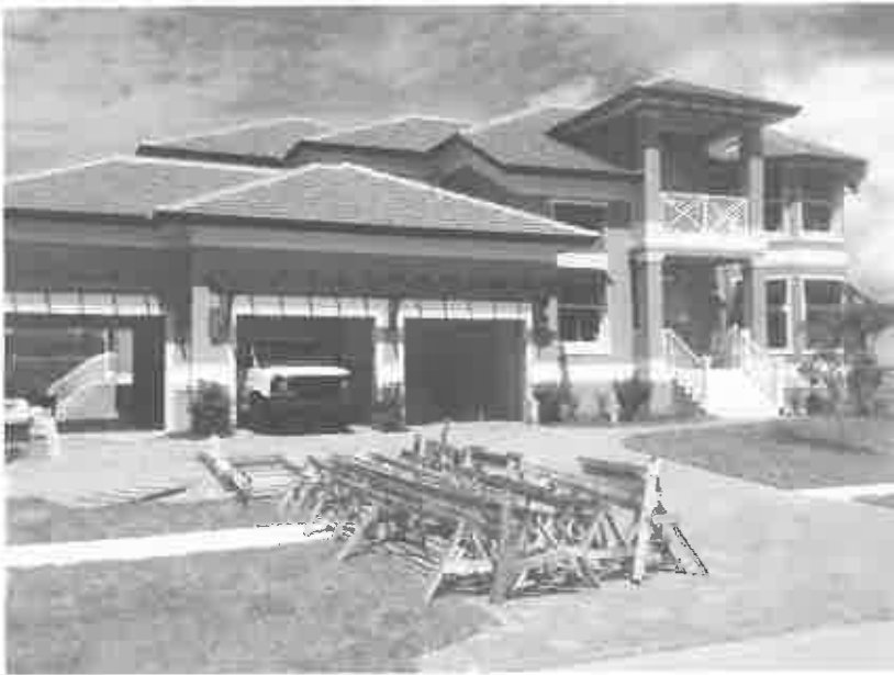
Front View 10/2/2012

If using the Elevation Certificate to obtain NFIP flood insurance, affix at least two building photographs below according to the instructions for Item A6. Identify all photographs with: date taken; "Front View" and "Rear View"; and, if required, "Right Side View" and "Left Side View." If submitting more photographs than will fit on this page, use the Continuation Page, following.