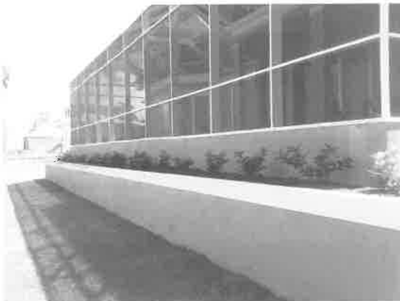
Rear View 10/2/2012