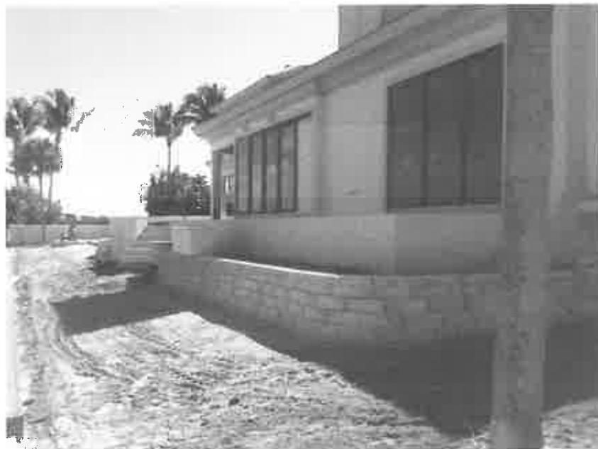
Rear View 2/22/2013