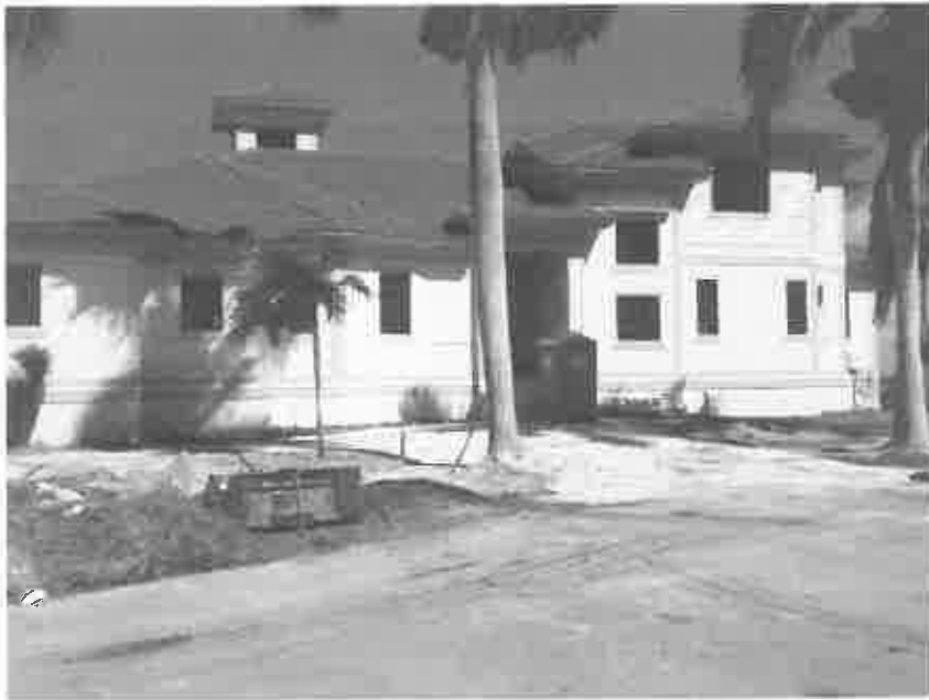
Front View 2/22/2013

If using the Elevation Certificate to obtain NFIP flood insurance, affix at least two building photographs below according to the instructions for Item A6. Identify all photographs with: date taken; "Front View" and "Rear View"; and, if required, "Right Side View" and "Left Side View." If submitting more photographs than will fit on this page, use the Continuation Page, following.