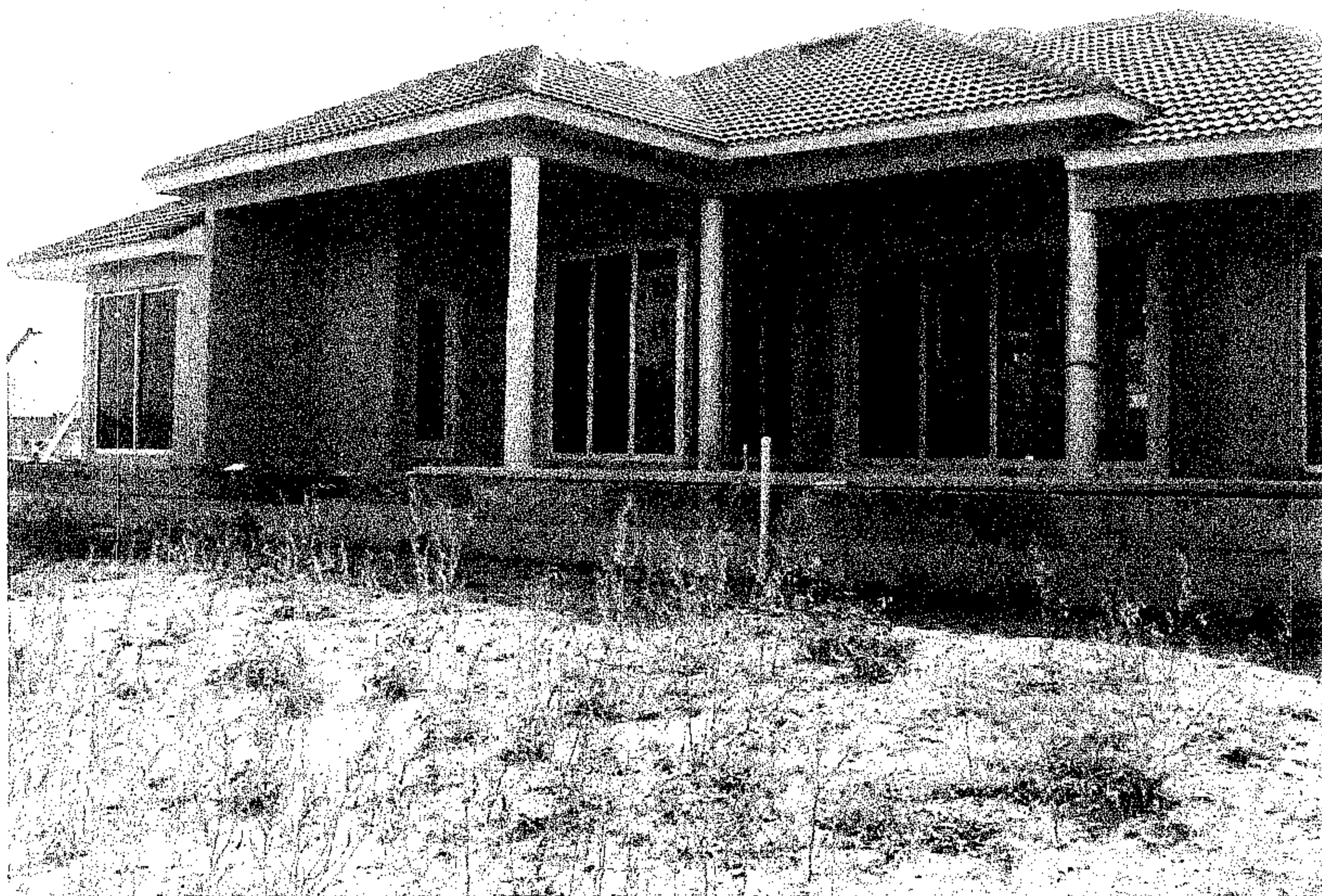
Rear View 01/18/08