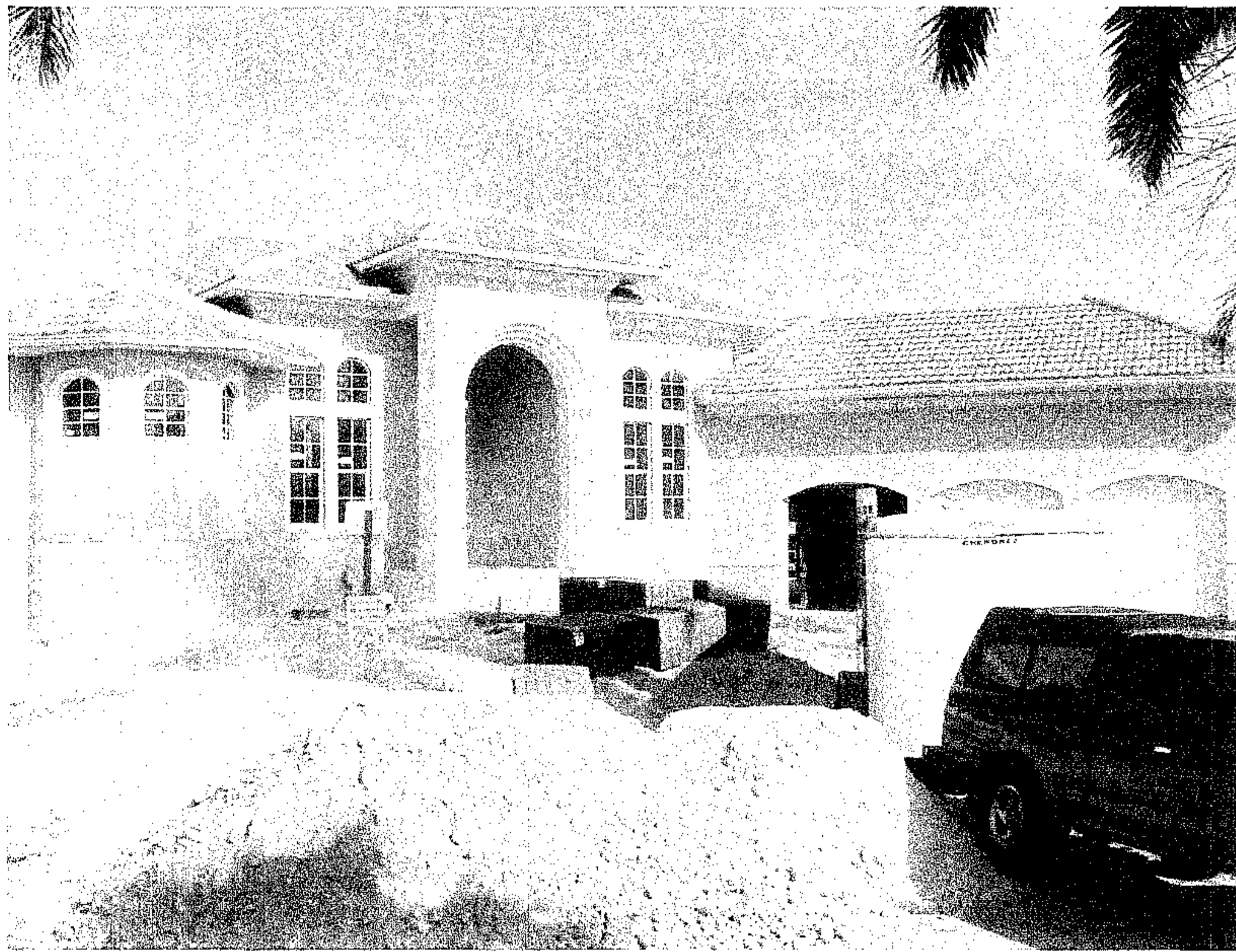
Front View 01/18/08

If using the Elevation Certificate to obtain NFIP flood insurance, affix at least two building photographs below according to the instructions for Item A6. Identify all photographs with: date taken; "Front View" and "Rear View"; and, if required, "Right Side View" and "Left Side View." If submitting more photographs than will fit on this page, use the Continuation Page, following.