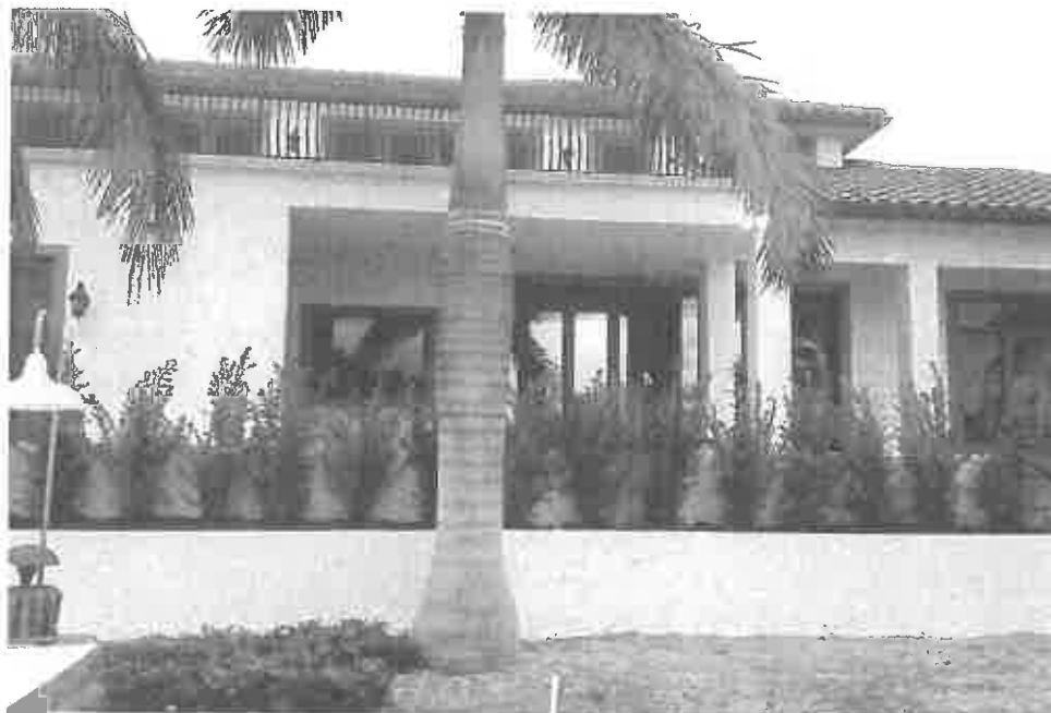
REAR VIEW DATE TAKEN: DECEMBER 5, 2012