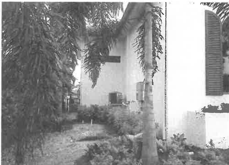
LEFT SIDE VIEW DATE TAKEN: DECEMBER 5, 2012