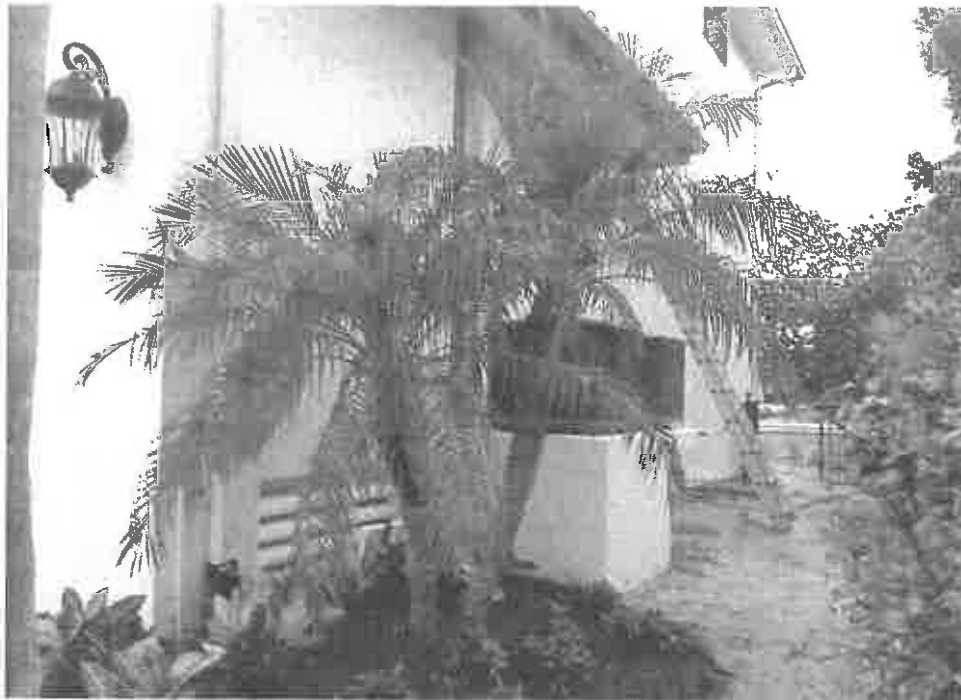
RIGHT SIDE VIEW DATE TAKEN: DECEMBER 5, 2012