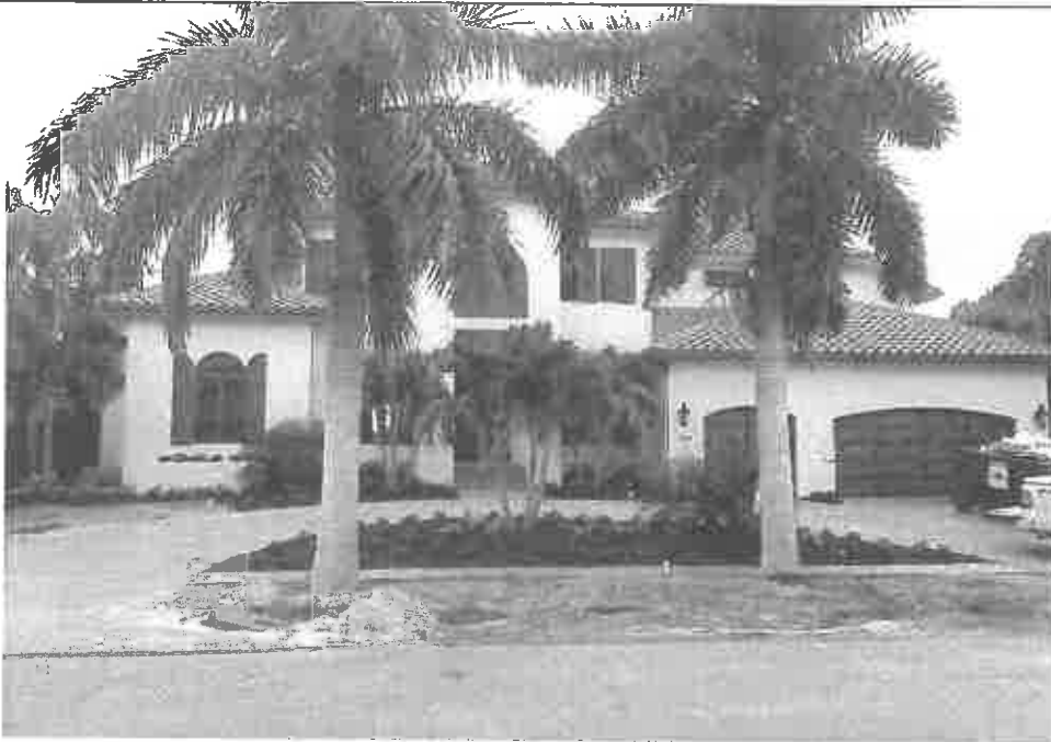
FRONT VIEW DATE TAKEN: DECEMBER 5, 2012