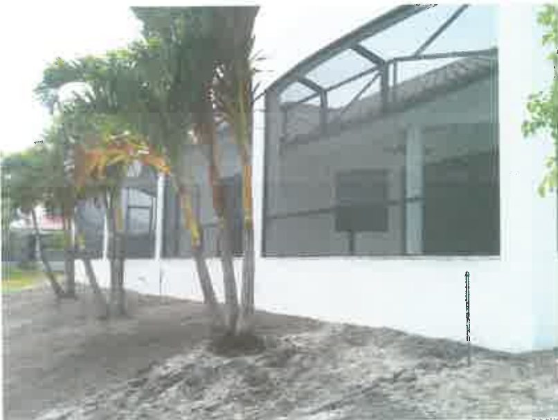
REAR VIEW 5/28/2013