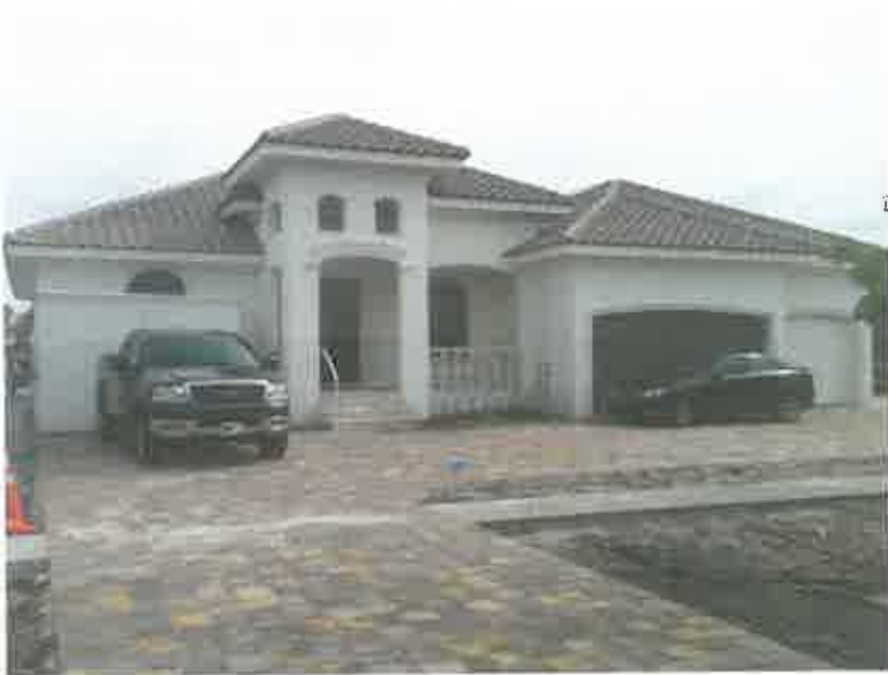
FRONT VIEW 5/28/2013

If using the Elevation Certificate to obtain NFIP flood insurance, affix at least 2 building photographs below according to the instructions for Item A6. Identify all photographs with date taken; "Front View" and "Rear View"; and, if required, "Right Side View" and "Left Side View." When applicable, photographs must show the foundation with representative examples of the flood openings or vents, as indicated in Section A8. If submitting more photographs than will fit on this page, use the Continuation Page.