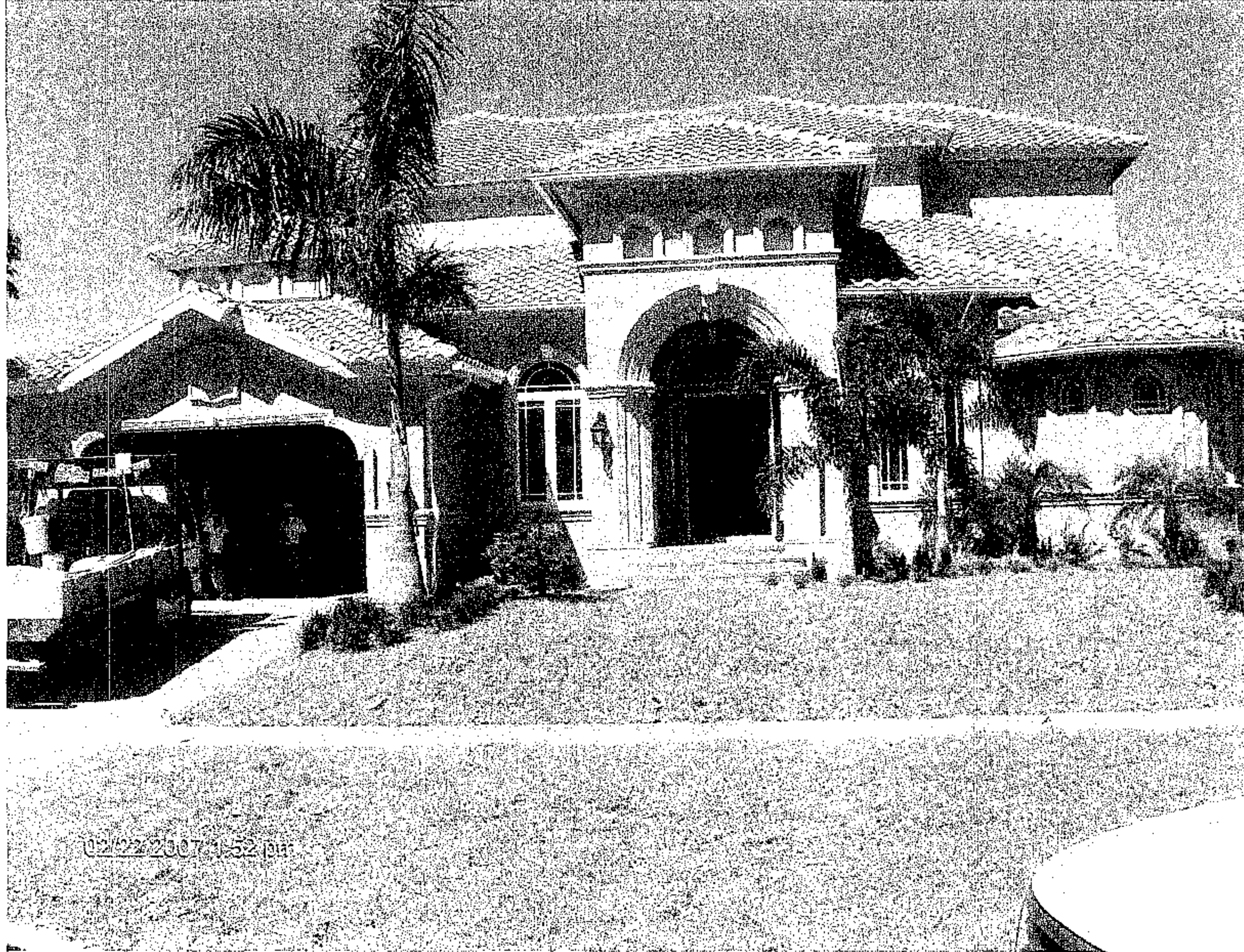
Front View 2/22/07

If using the Elevation Certificate to obtain NFIP flood insurance, affix at least two building photographs below according to the instructions for Item A6. Identify all photographs with: date taken; "Front View" and "Rear View"; and, if required, "Right Side View" and "Left Side View." If submitting more photographs than will fit on this page, use the Continuation Page, following.