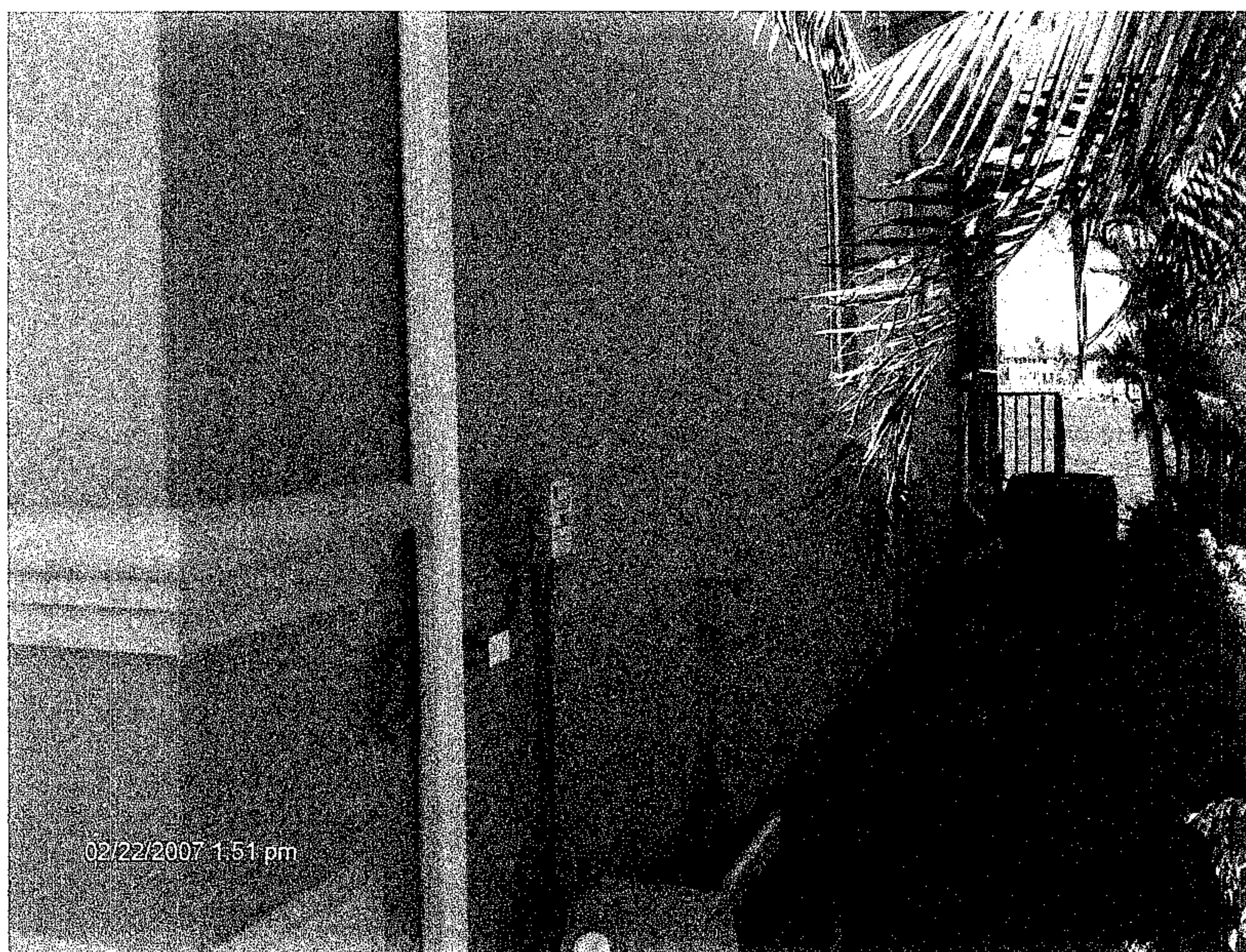
Right Side View 2/22/07