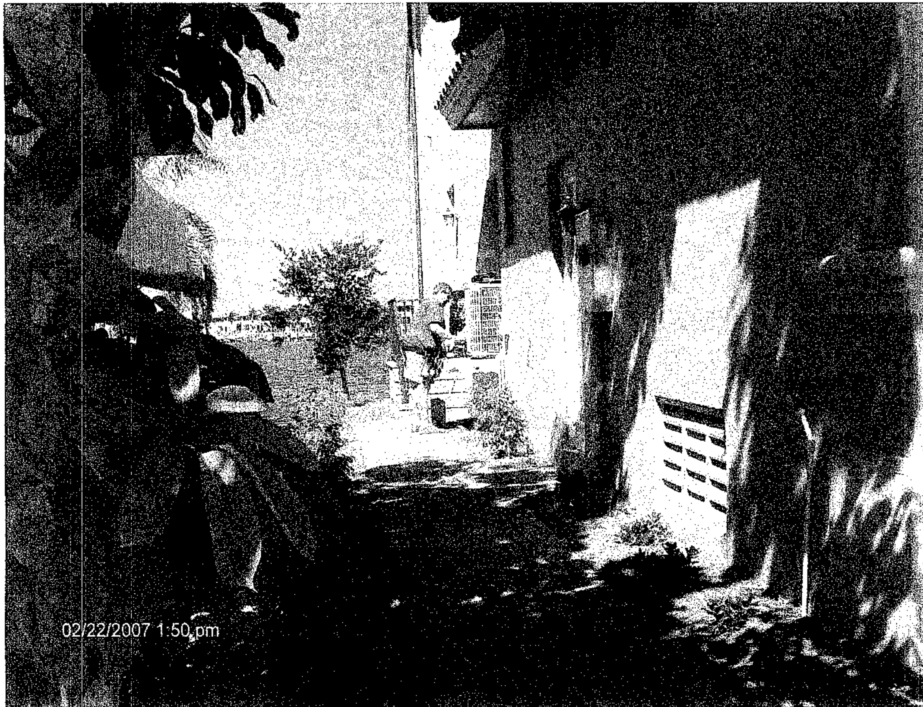
Left Side View 2/22/07

If using the Elevation Certificate to obtain NFIP flood insurance, affix at least two building photographs below according to the instructions for Item A6. Identify all photographs with: date taken; "Front View" and "Rear View"; and, if required, "Right Side View" and "Left Side View." If submitting more photographs than will fit on this page, use the Continuation Page, following.